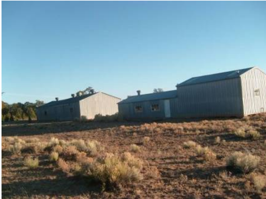
Photo 3. Grey buildings, north side