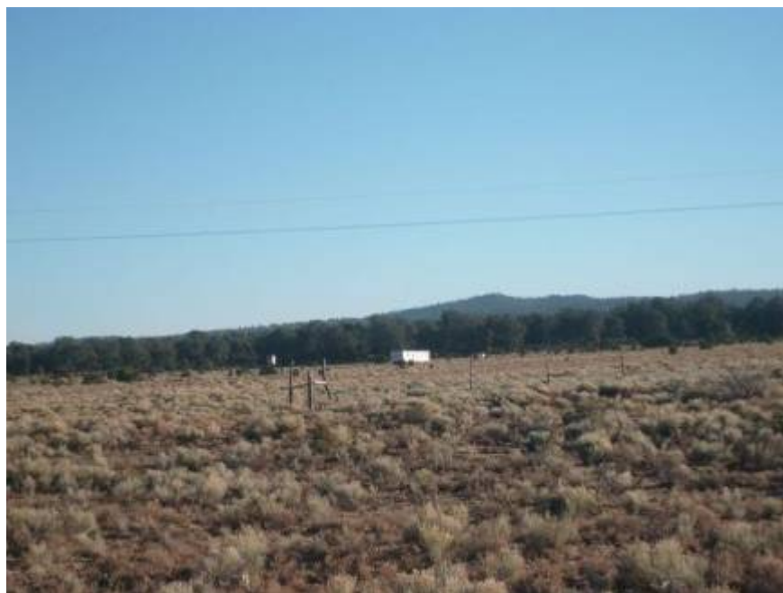
Photo 2. Mac No. 1 mine site, looking south/southeast towards trailer