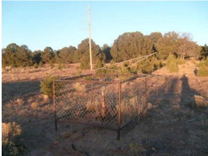
Photo 9. Old well with downed windmill behind it, towards the northeast on south side of grey buildings