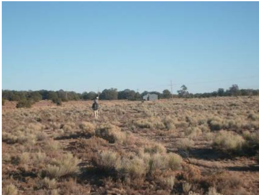
Photo 1. Mac No. 1 mine site, looking east towards grey buildings