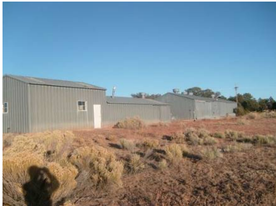
Photo 4. Grey buildings, south side