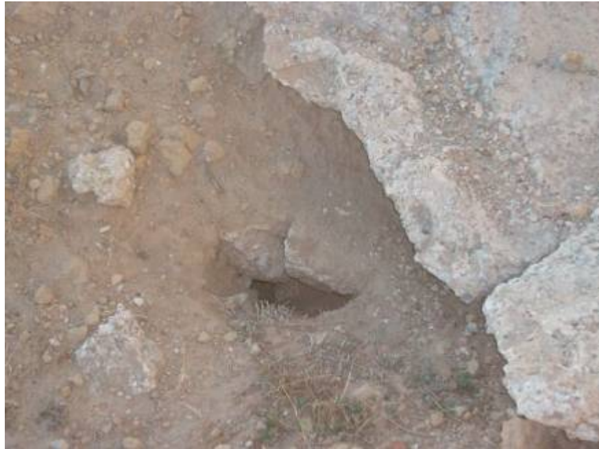
Photo 7. Hole on south side of grey building, at the end of concrete pad