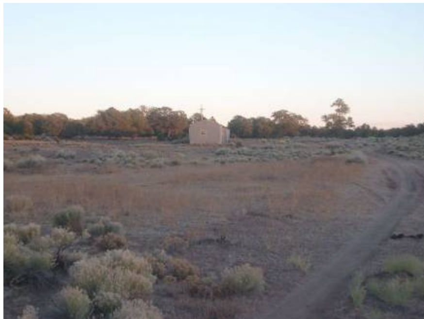
Photo 10. Difference in vegetation from road to grey buildings, towards the east