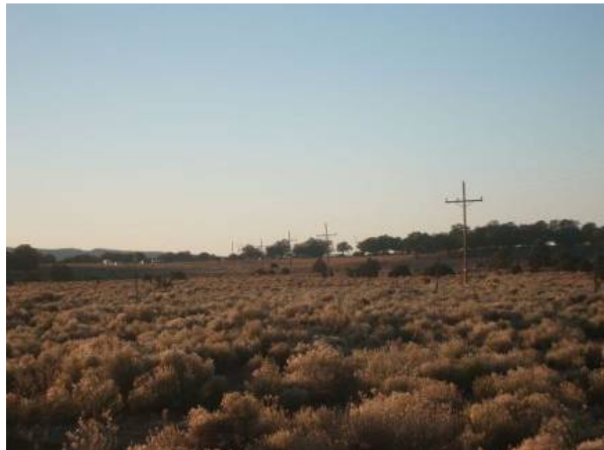
Photo 6. Residences towards the west