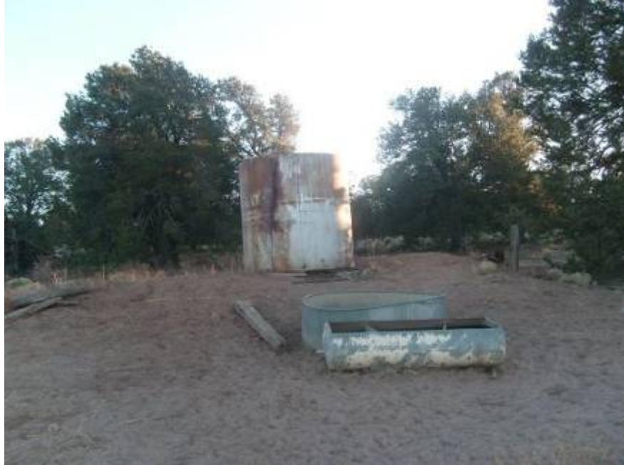
Photo 5. Water tank at south end, towards the south