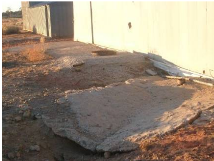
Photo 8. Concrete pads on south side of grey buildings