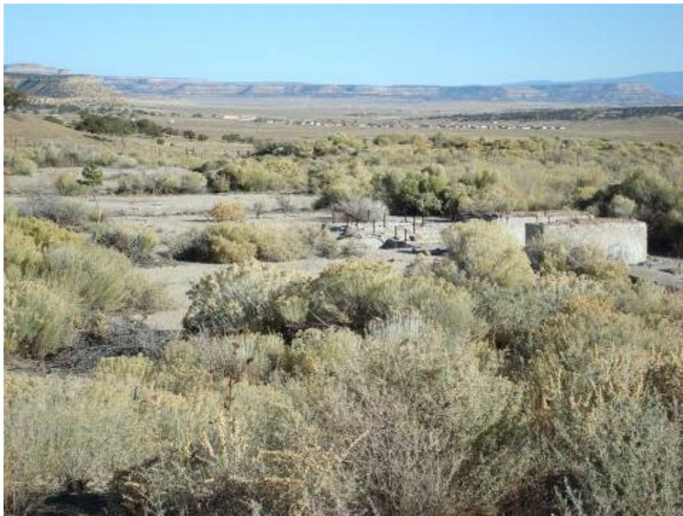
Photo 2. Black Jack No. 1 Mine site, ore processing area.