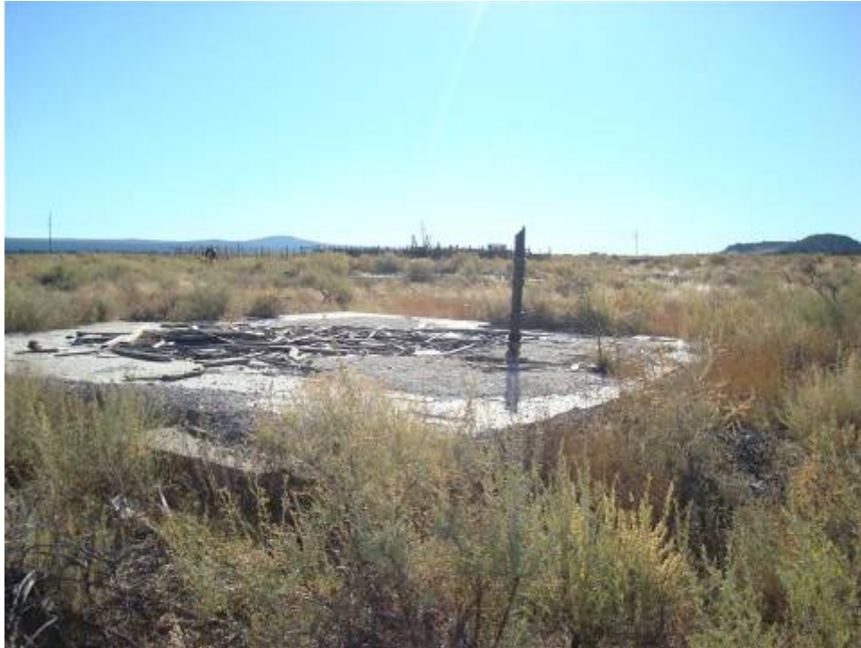
Photo 1. Black Jack No. 1 Mine site, possible former barracks.