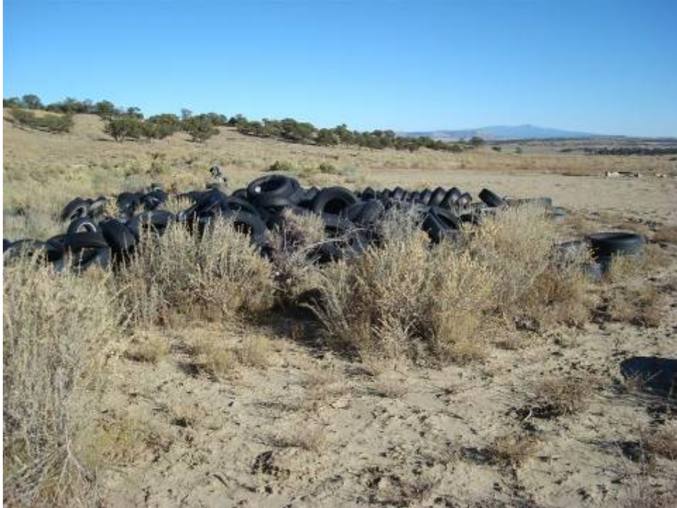
Photo 5. Black Jack No. 1, dumping of tires north of the mine.