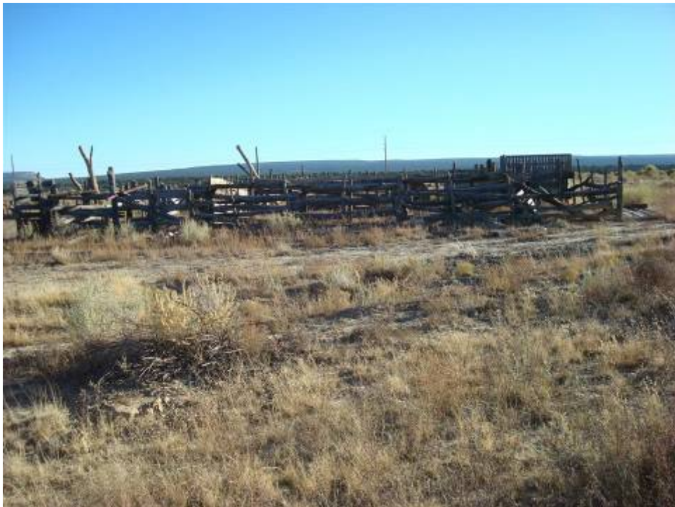
Photo 6. Black Jack No. 1, livestock corral in site.