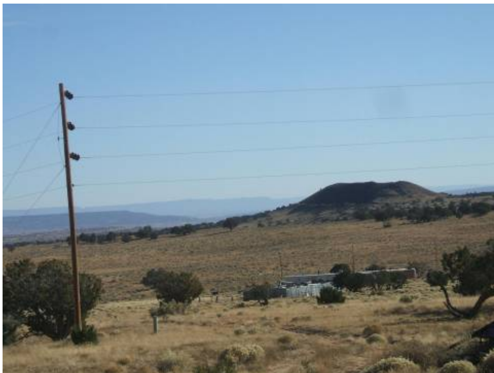
Photo 4. Haystack mine site 1039, houses approximately 750 feet southease of site, towards the south