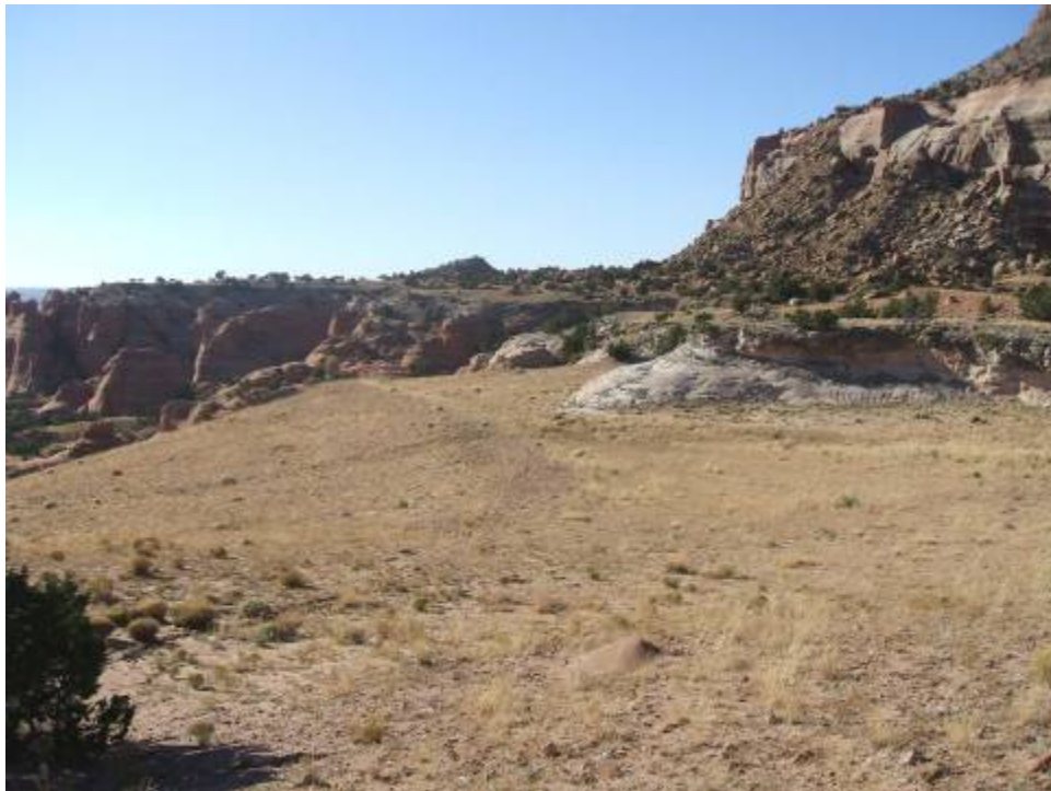
Photo 6. Haystack mine site 342, towards the northwest