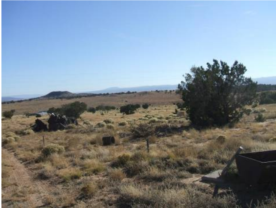
Photo 3. Haystack mine site 1039, towards the south