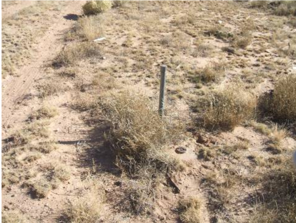
Photo 5. Haystack mine site 1039, water pipe, towards the south