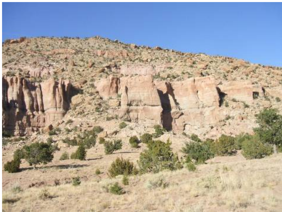
Photo 8. Haystack mine site 1038, towards the north