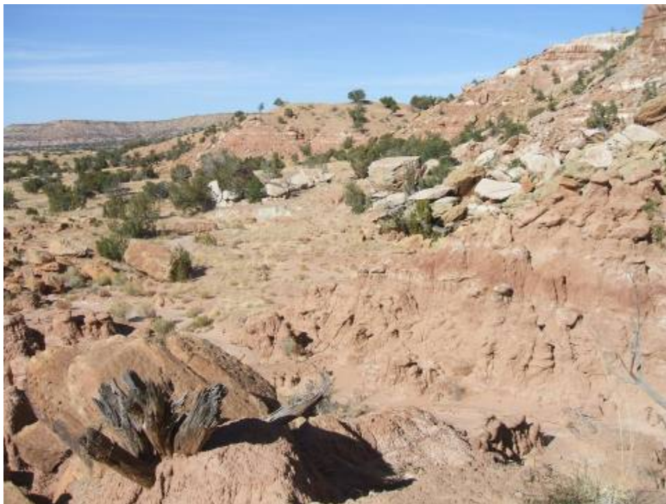
Photo 2. Haystack mine site 345, towards the north/northwest