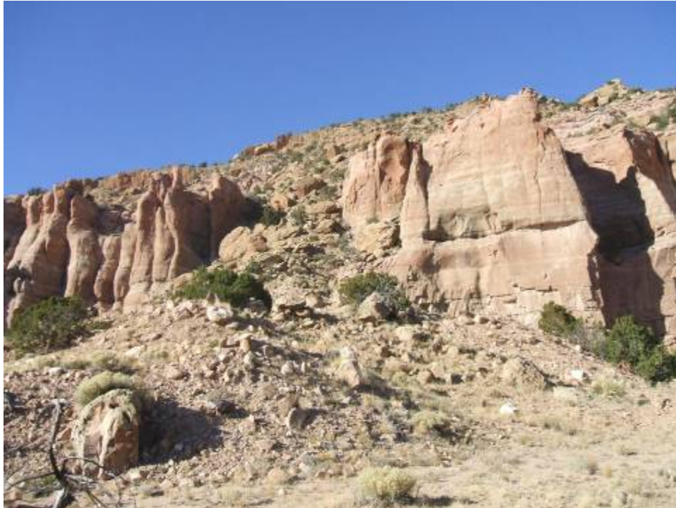
Photo 7. Haystack mine site 1038, towards the north