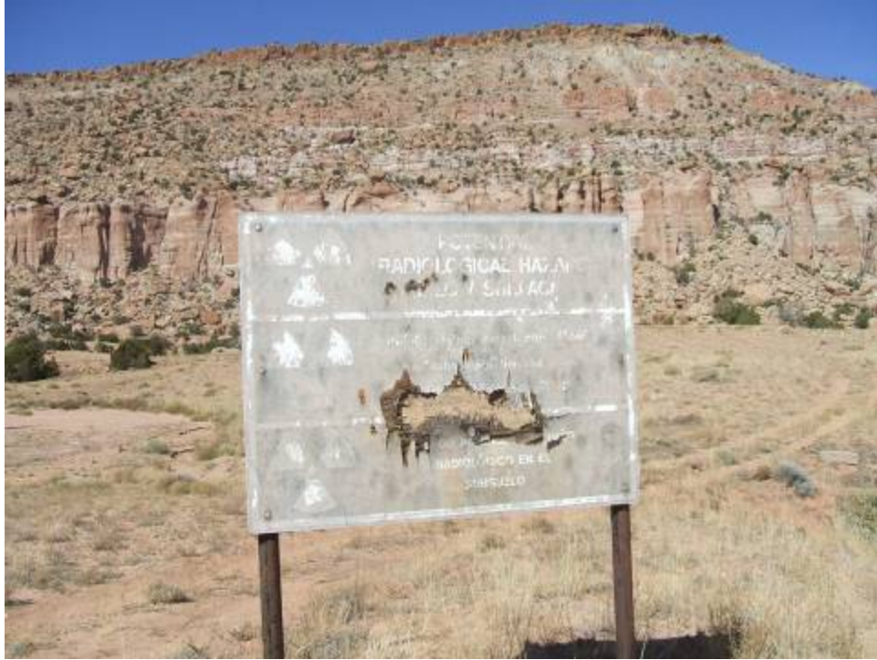
Photo 3. Section 18 mine site “Potential Radiological Hazard” sign, towards the north