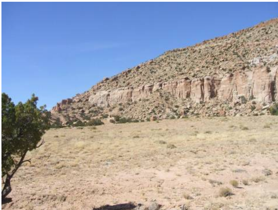
Photo 2. Section 18 mine site, towards the northwest