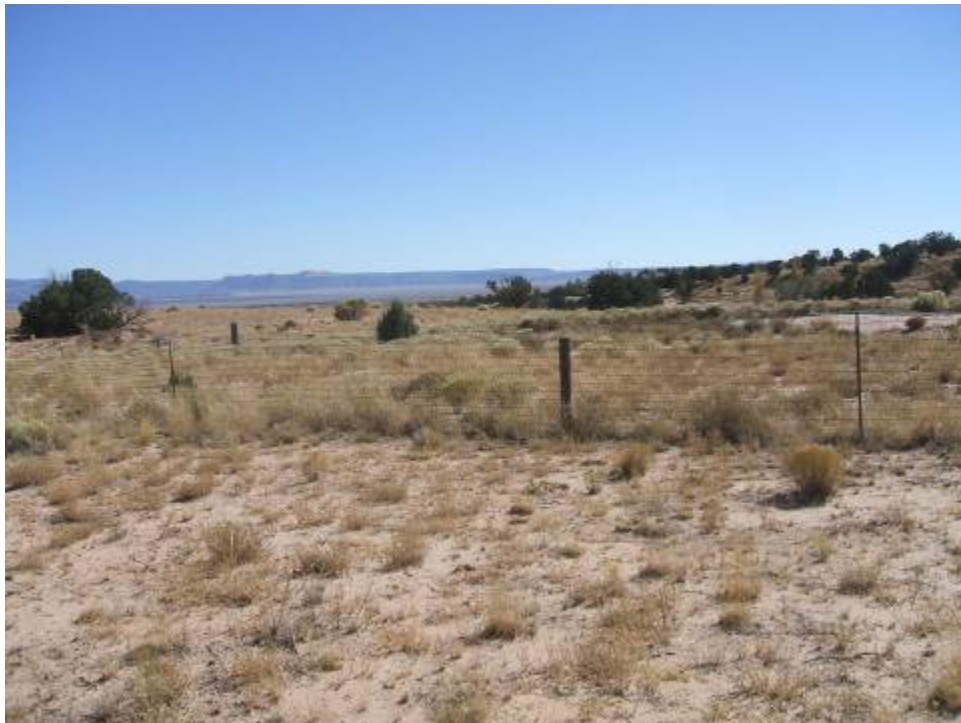
Photo 4. Section 18 mine site fenced enclosure, towards the east