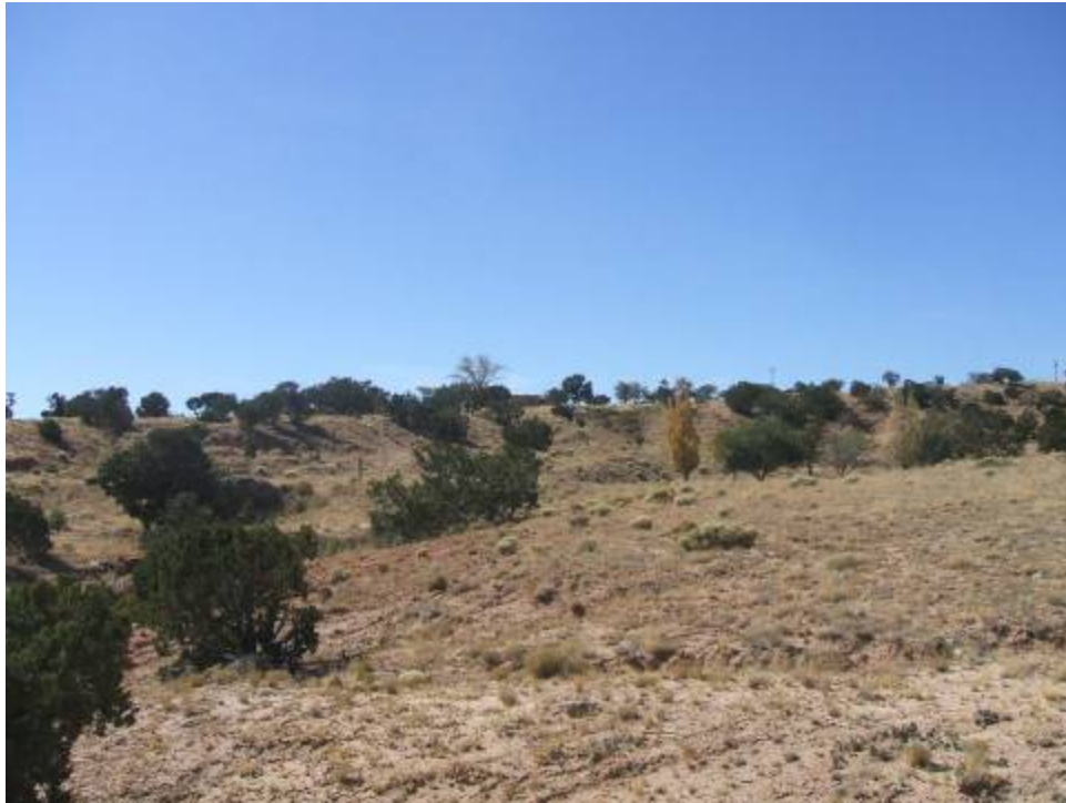
Photo 1. Section 18 mine site, towards the south