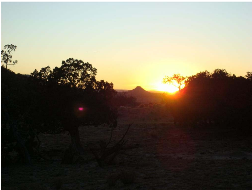
Photo 2. Pat Mine site, towards the west