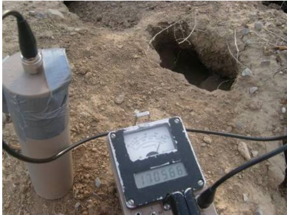
Photo 5. Reading taken at animal burrows along fence at southern end of site