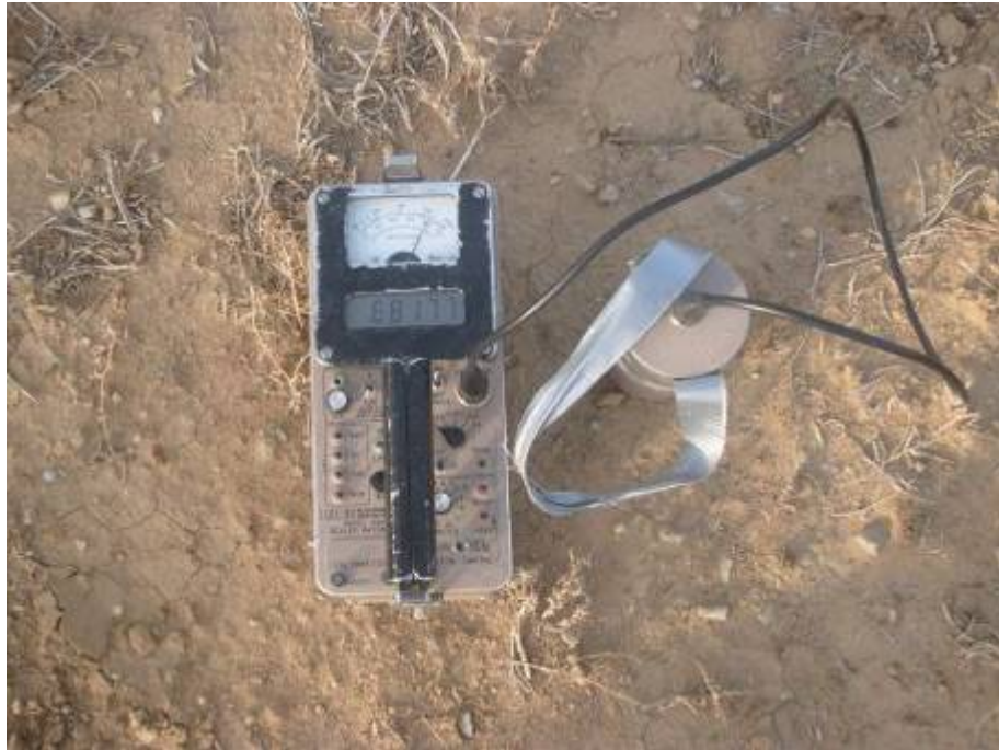
Photo 3. Reading taken at hot area around southwest corner of site