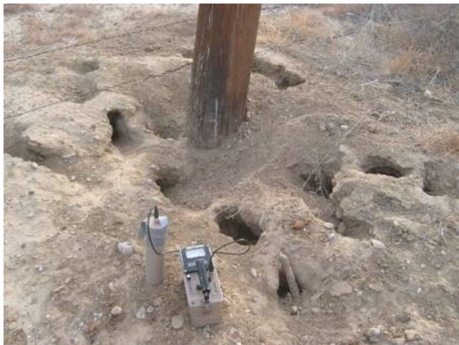
Photo 6. Animal burrows along fence at southern end of site