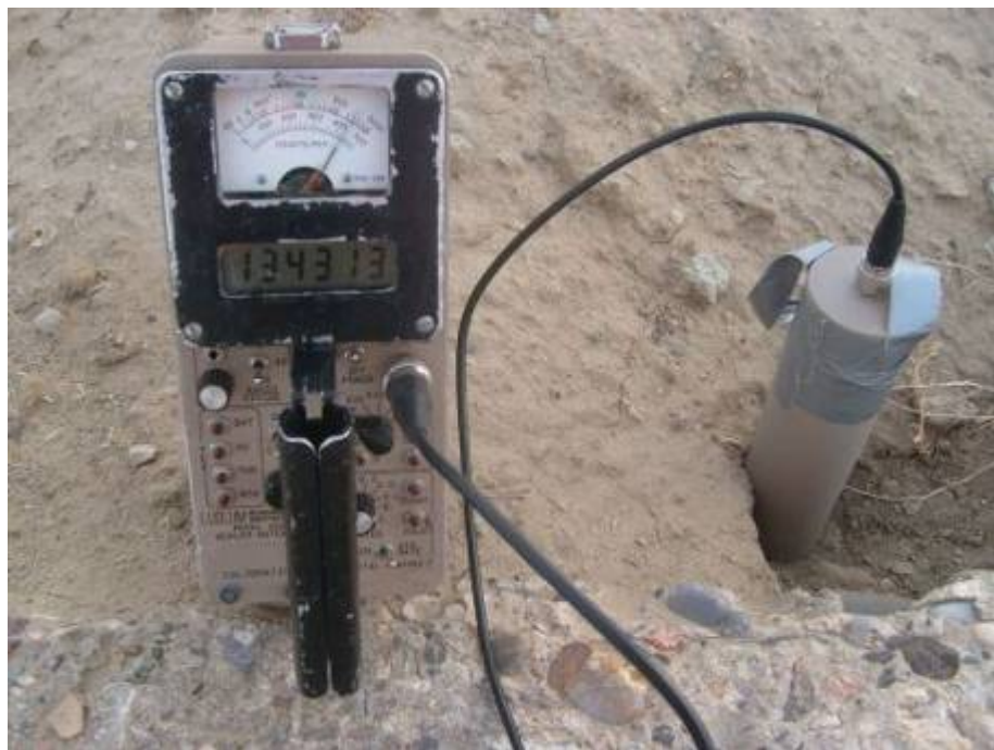
Photo 8. Reading taken at concrete vault along south fence