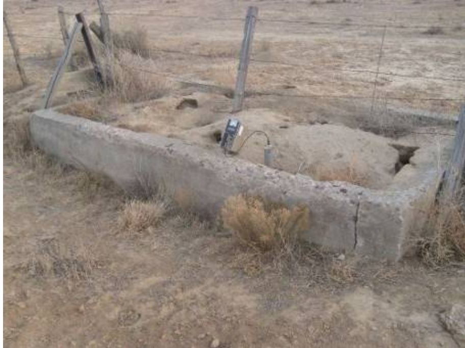
Photo 9. Concrete vault along south fence