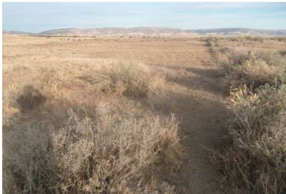
Photo 2. Homestake Sapin 15 mine site, towards the northeast from southwest corner