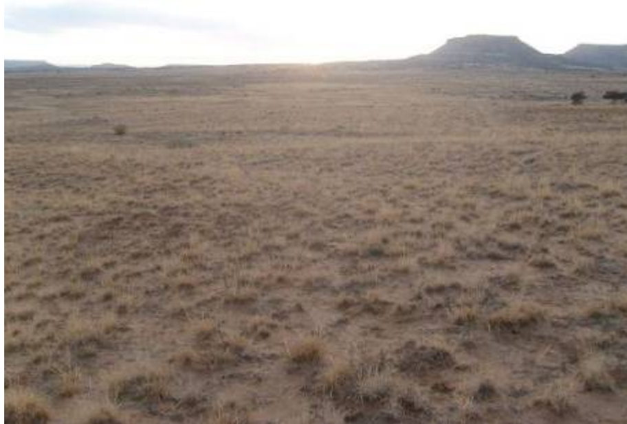
Photo 10. View from atop a hill at northeast corner of site, towards the southwest Note: Field vehicle in distance showing size/length of site