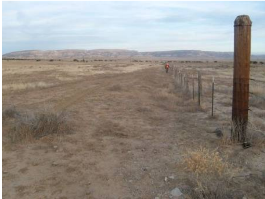
Photo 7. GPS walking west along southern fence