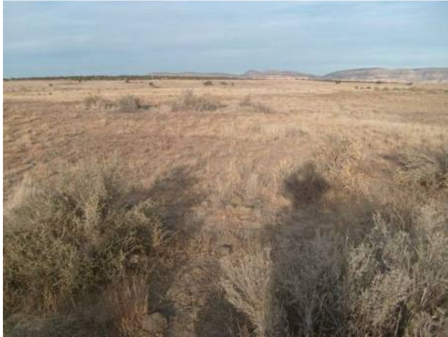
Photo 1. Homestake Sapin 15 mine site, towards the northeast from southwest corner