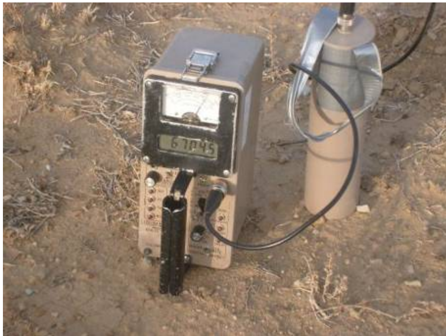
Photo 4. Reading taken at hot area around southwest corner of site