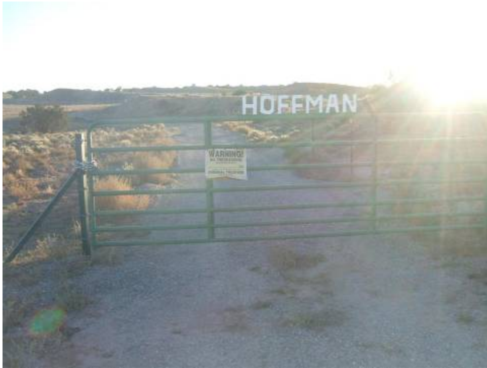
Photo 1. Locked gate on road leading towards Section 30 mine site