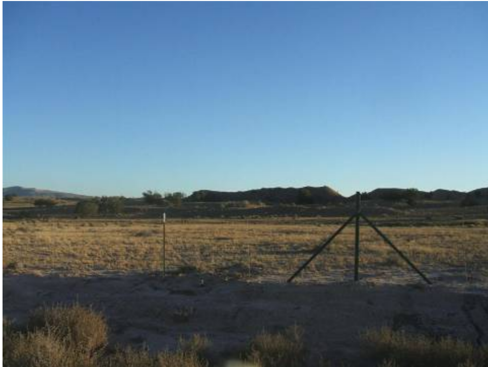
Photo 3. Fenced area leading towards Section 30 mine site