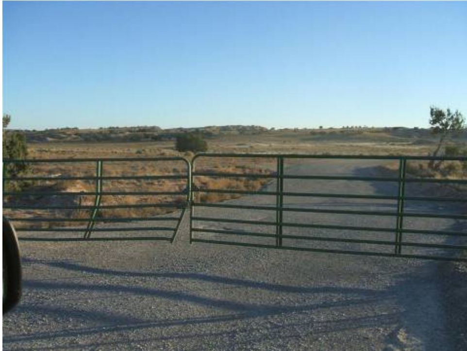
Photo 2. Locked gate leading towards Section 30 mine site