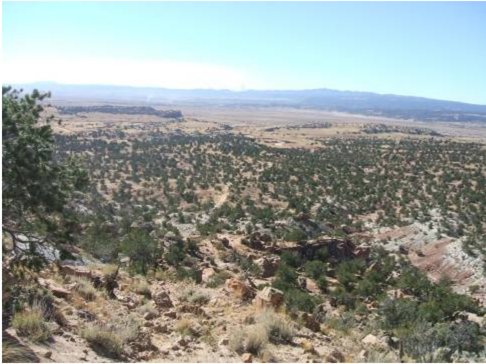
Photo 3. Mine site and surrounding vicinity, towards the south