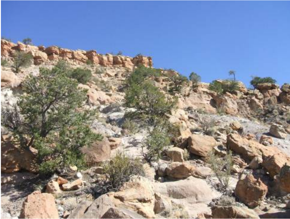
Photo 1. Mine site, towards the north