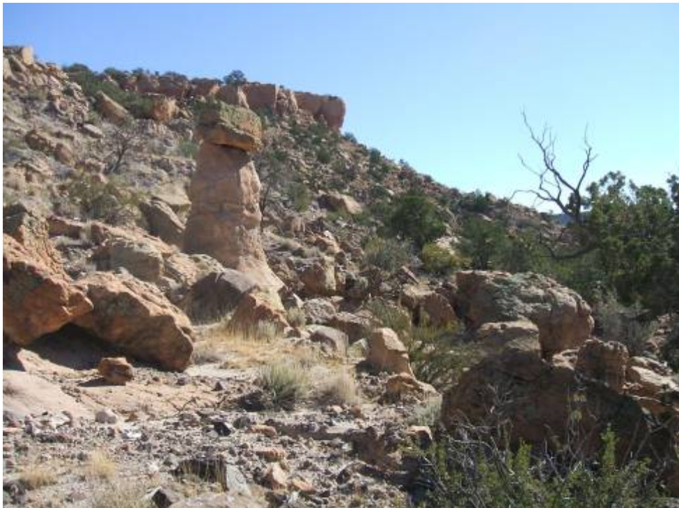
Photo 2. Mine site, towards the east