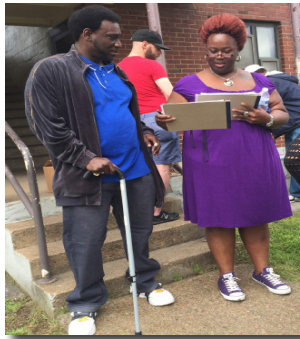
EMI participant engages with community members during air quality testing.

The EJ IWG hosted an EMI workshop at the 2016 National Environmental Justice Conference (NEJC), which featured presentations on climate justice projects from students attending Minority Serving Institutions. Students were able to share their work and gain valuable insight from other professionals and activists in the environmental justice movement.