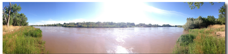
Valle de Oro National Wildlife Refuge during their 2016 "Abrazos- A Community Celebration of Environmental Justice Day" event.

The project uses surveys, dialog with community leaders, public outreach, and training to establish baseline community knowledge around environmental and public health concerns and the relationship between the Refuge and sustainable solutions to the concerns, and to raise awareness of the Refuge and its development and encourage community participation. The Refuge serves as a model for the DOI for the incorporation of Urban Refuge Standards of Excellence and the development of new Urban National Wildlife Refuges nationwide.