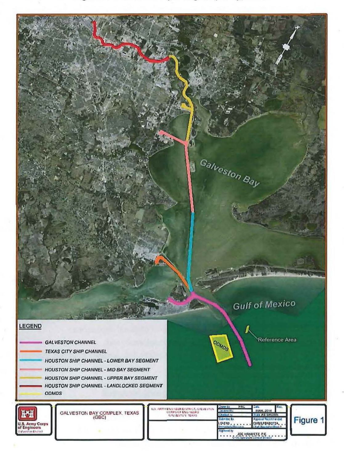
Figure 1: Galveston Bay Complex (GBC), Texas