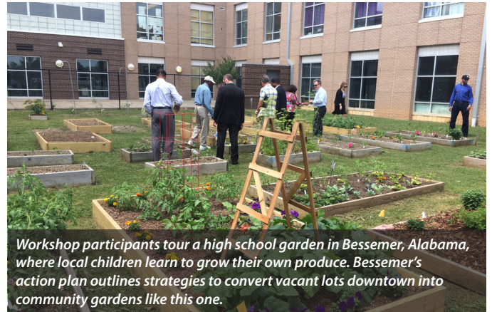
Workshop participants tour a high school garden in Bessemer, Alabama, where local children learn to grow their own produce. Bessemer's action plan outlines strategies to convert vacant lots downtown into community gardens like this one.

The Winder Housing Authority in Winder, Georgia , received technical assistance to develop a community kitchen and community garden in the city's new Wimberly Center for Community Development, which is in a former middle school building.