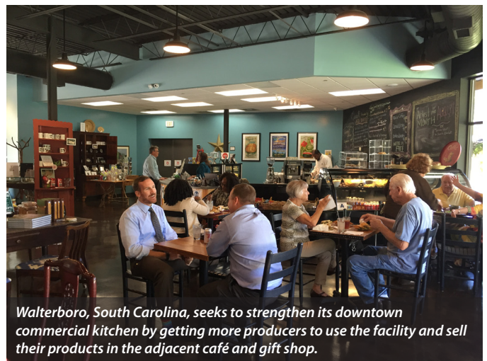
Walterboro, South Carolina, seeks to strengthen its downtown commercial kitchen by getting more producers to use the facility and sell their products in the adjacent café and gift shop.