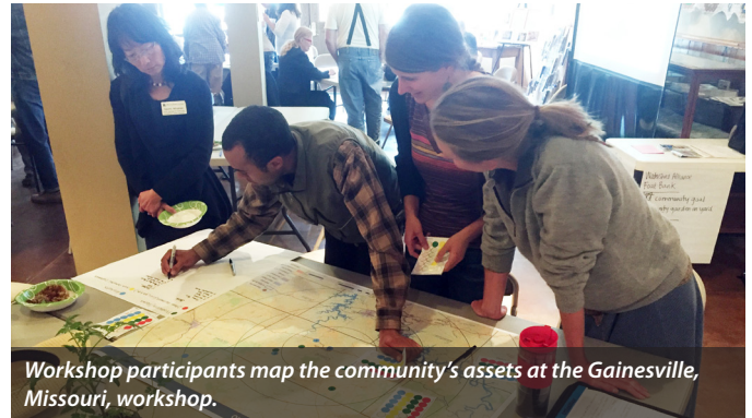
Workshop participants map the community's assets at the Gainesville, Missouri, workshop.

The Colleton Museum and Farmers Market in Walterboro, South Carolina , explored strategies to strengthen the downtown farmers market and commercial kitchen and help revitalize downtown as a local foods and arts destination.