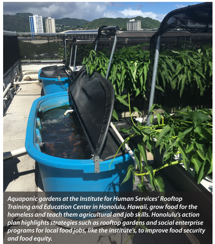
Aquaponic gardens at the Institute for Human Services' Rooftop Training and Education Center in Honolulu, Hawaii, grow food for the homeless and teach them agricultural and job skills. Honolulu's action plan highlights strategies such as rooftop gardens and social enterprise programs for local food jobs, like the institute's, to improve food security and food equity.