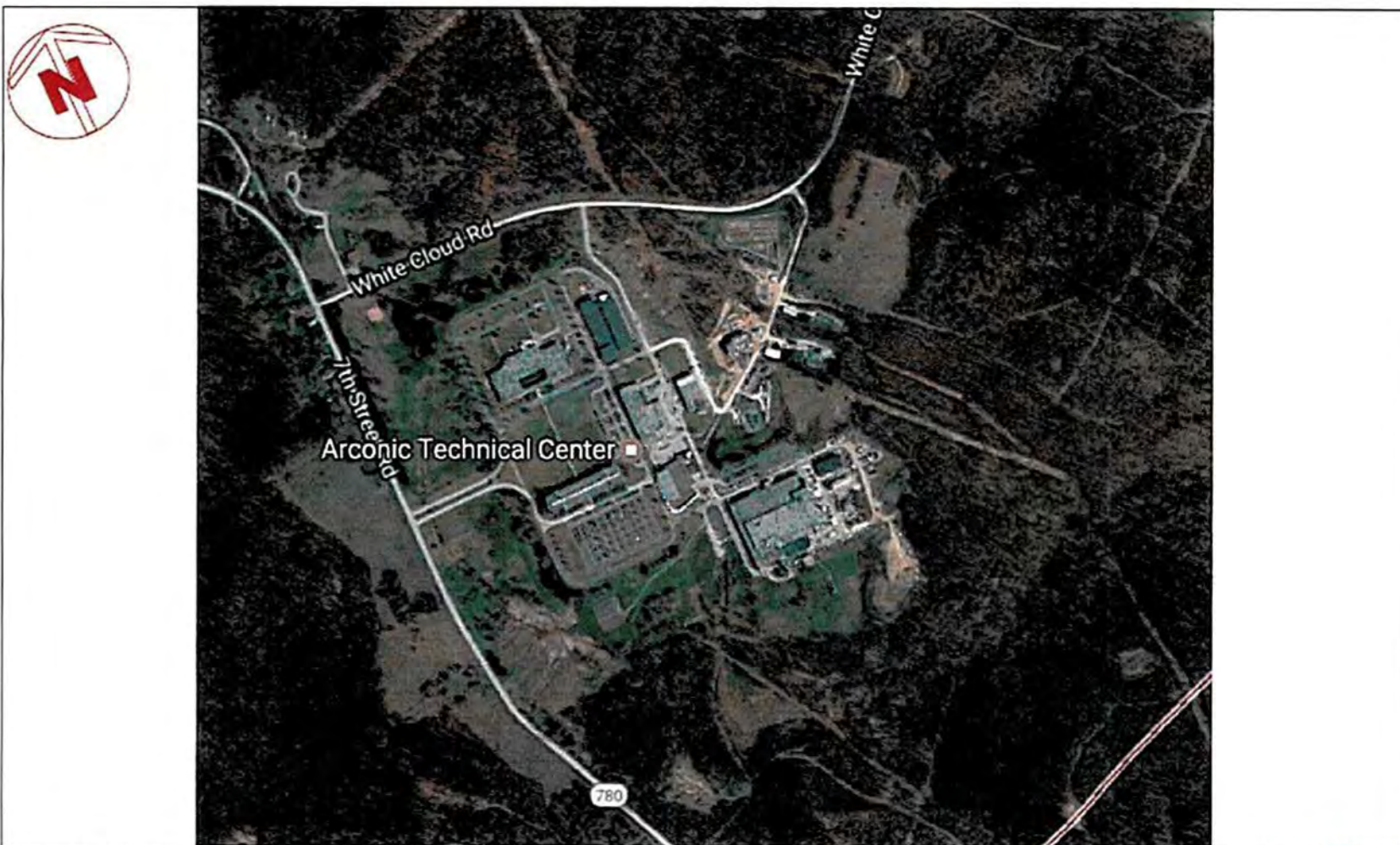
Figure 1: Site Location Map Arconic 100 Technical Drive New Kensington PA 15069