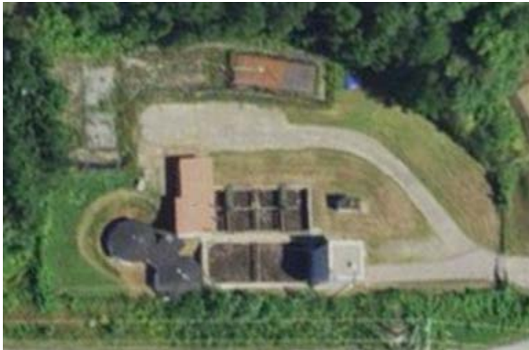
Rock Island WWTF.

The Rock Island WWTF is a 1.09 MGD activated sludge wastewater treatment plant with aerated digesters. It was last fully upgraded in the 1980s with the original project to connect Derby Line. The facility is now in very poor condition with substantial portions of equipment abandoned in place. Due to problems with the flow metering and reporting, it is not clear if the facility is meeting its discharge limits or not. The Province of Quebec is requiring that the facility refurbishment project be completed by March 2018. Stanstead will not be able to meet that deadline and officials are currently seeking a 1 year extension from their regulators.