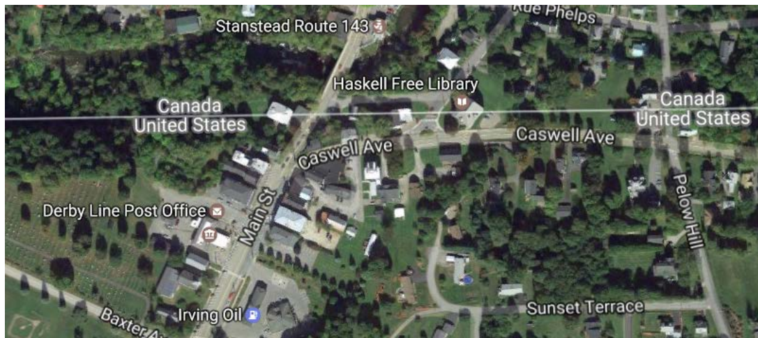
Derby Line and Stanstead as shown by Google Maps

Rock Island and Derby Line are one community sharing many resources. Businesses, homes, and neighborhoods span the border with some neighbors on one side living in Canada and other neighbors in Vermont. They share a Library and performing arts space called the Haskell Free Library and Opera House , which is also located directly on the border.