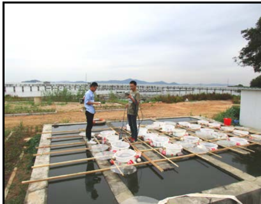
Picture 2. Mesocosm Study Enclosures, China