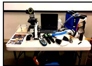
CyanoScope & CyanoMonitoring Kit Cyanobacteria Monitoring Collaborative