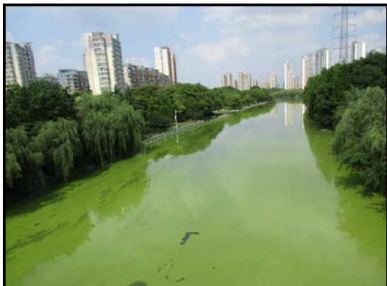
Picture 1. Lake Taihu, City of Wuxi, China