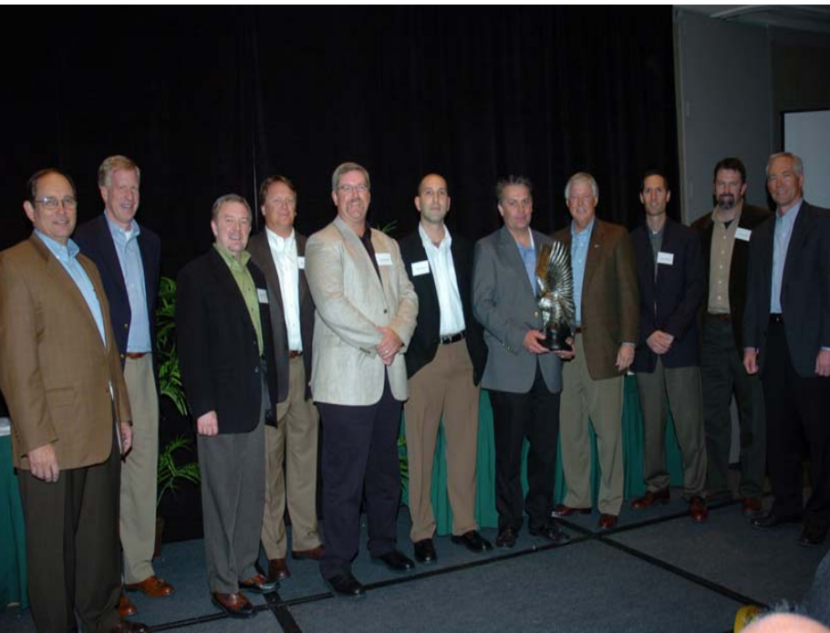
2005 Chairman's Award Rocky Mountain – DJ Basin Area