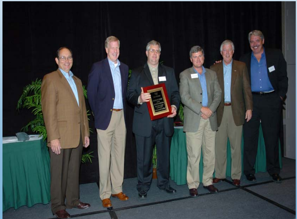
2005 Award of Merit Gulf of Mexico – Central Shelf