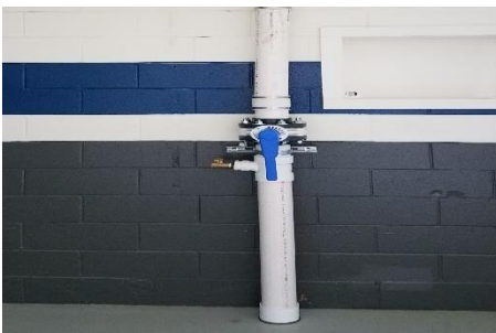
The treatment system uses extraction points drilled through the building's foundation to remove chemical vapors

If monitoring during the pilot indicates that emissions have the potential to exceed thresholds, the study will cease and the Facility will be required to submit a permit application to MDEQ. Intermediate ventilation measures will resume to manage TCE concentrations inside the Facility during the processing of the permit application. The air permit will be drafted by MDEQ and made available for public comment before being issued.