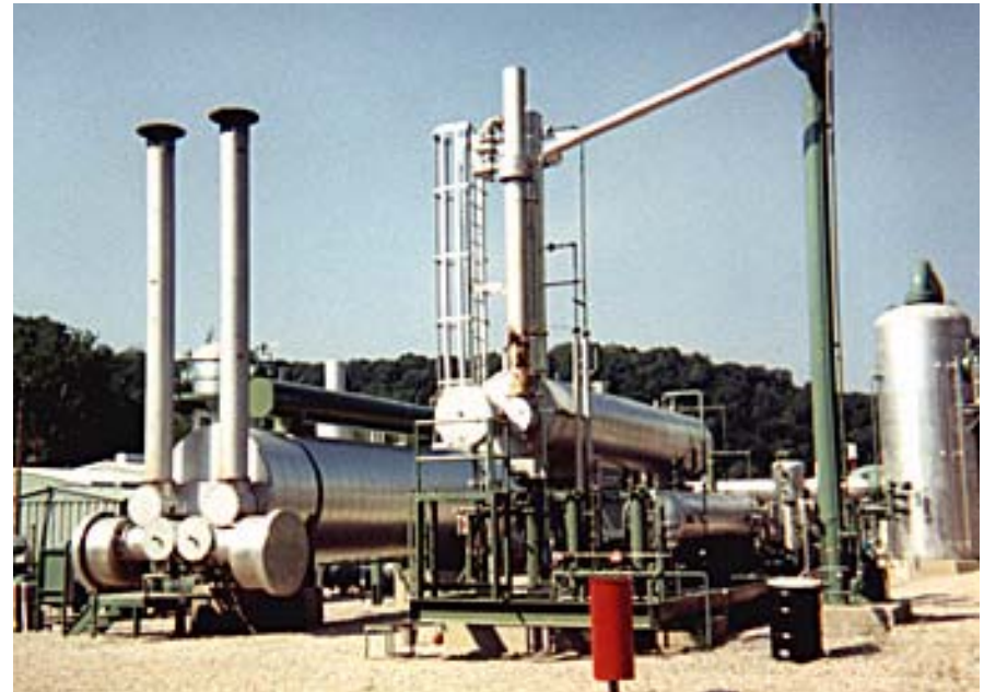
Glycol Dehydrator Unit