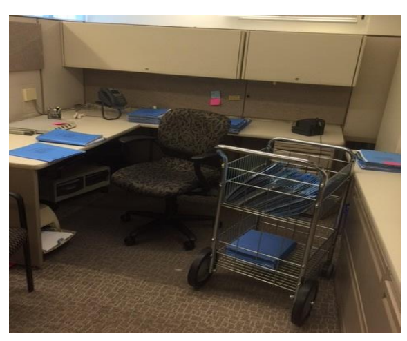
OHR cubicle with leave bank case files in EPA headquarters, April 2016.

According to the EPA's former VLBP national program manager, who retired in the fall of 2015, cabinets in which leave bank case files were stored were not locked. During our site visit to the OHR in April 2016, we observed about 100 recipient case files that were left outside the file cabinets and on a desk inside an unoccupied office cubicle. The case files were left out at the end of the work day on a Thursday evening and the national leave bank coordinator was not due back to the office until the following Monday. It appears that