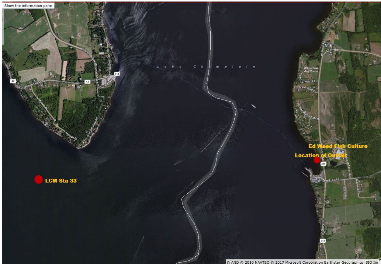
Figure 1. Approximate location of outfall outlet, relative to the Lake Champlain Long-term Biological and Chemical Monitoring Program station.