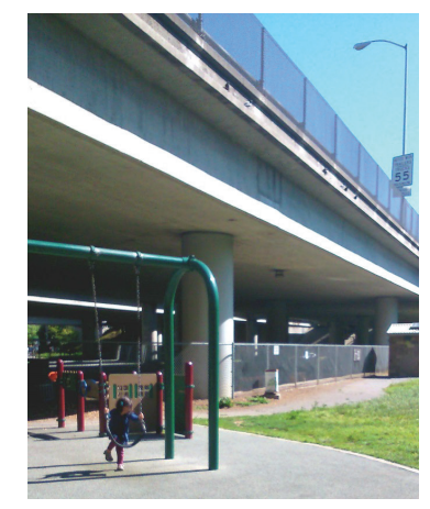
Proximity to traffic is one of the 11 environmental indicators.

EJSCREEN is an environmental justice screening and mapping tool that utilizes standard and nationally-consistent data to highlight places that may have higher environmental burdens and vulnerable populations. The tool provides both summary