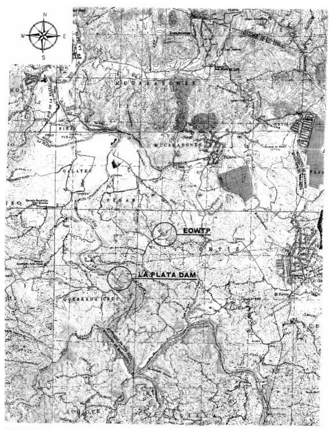
TTE LOCATION ON PARTIAL REPRODUCTION OF THE /EGA ALTA AND COROZAL TOPOGRAPHIC QUADRANGLES SCALE 1: 40,000