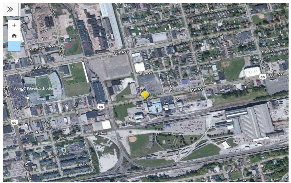
Figure 1. Location of the Flint Pigments Group Huntington, WV facility.

The investigation and remedial activities at the facility are being conducted under the direction of the United States Environmental Protection Agency (USEPA) Region 3's RCRA Corrective Action Program, with assistance from the West Virginia Department of Environmental Protection. USEPA Region 3 has identified eleven Areas of Concern (AOCs) at the Facility including: a landfill, above ground storage tanks, electrical transformers and a wastewater treatment system. An Area of Concern is an area where previous activities may have resulted in a release of chemicals to the environment that requires assessment and could require remediation. AOC 9 – Site-Wide Groundwater – is the AOC that is of primary interest as the source of potential vapor intrusion impacts in the off-site areas, but all AOCs are being studied and vapor intrusion is being evaluated in both off-site and on-site areas.