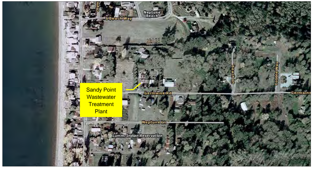
Figure A-2: Sandy Point WWTP Aerial Photograph (4369 Germaine Rd, Ferndale, WA).