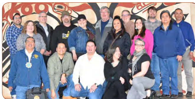
Region 10 RTOC Members