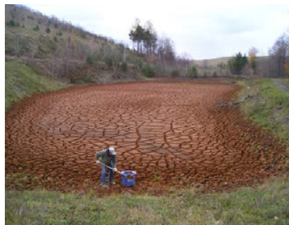
Sampling Acid Mine Drainage ochre in Elk County, PA