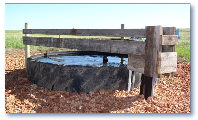
Figure 2. Livestock alternative water source.

uses of the impaired reach of the Thirty Mile Creek to fully supporting status. To support recreational use, fecal coliform bacteria concentrations at established monitoring sites must be reduced to an annual geometric mean of less than 200 colony-forming units per 100 milliliters of water (CFU/100 mL), with less than 10 percent of the samples exceeding 400 CFU/100 mL. Approximately midway through the project, the NDDoH transitioned to Escherichia coli bacteria sampling. The standards for E. coli bacteria require that geometric mean concentrations must remain less than 126 CFU/100 mL, and no more than 10 percent of the samples may exceed 409 CFU/100 mL.