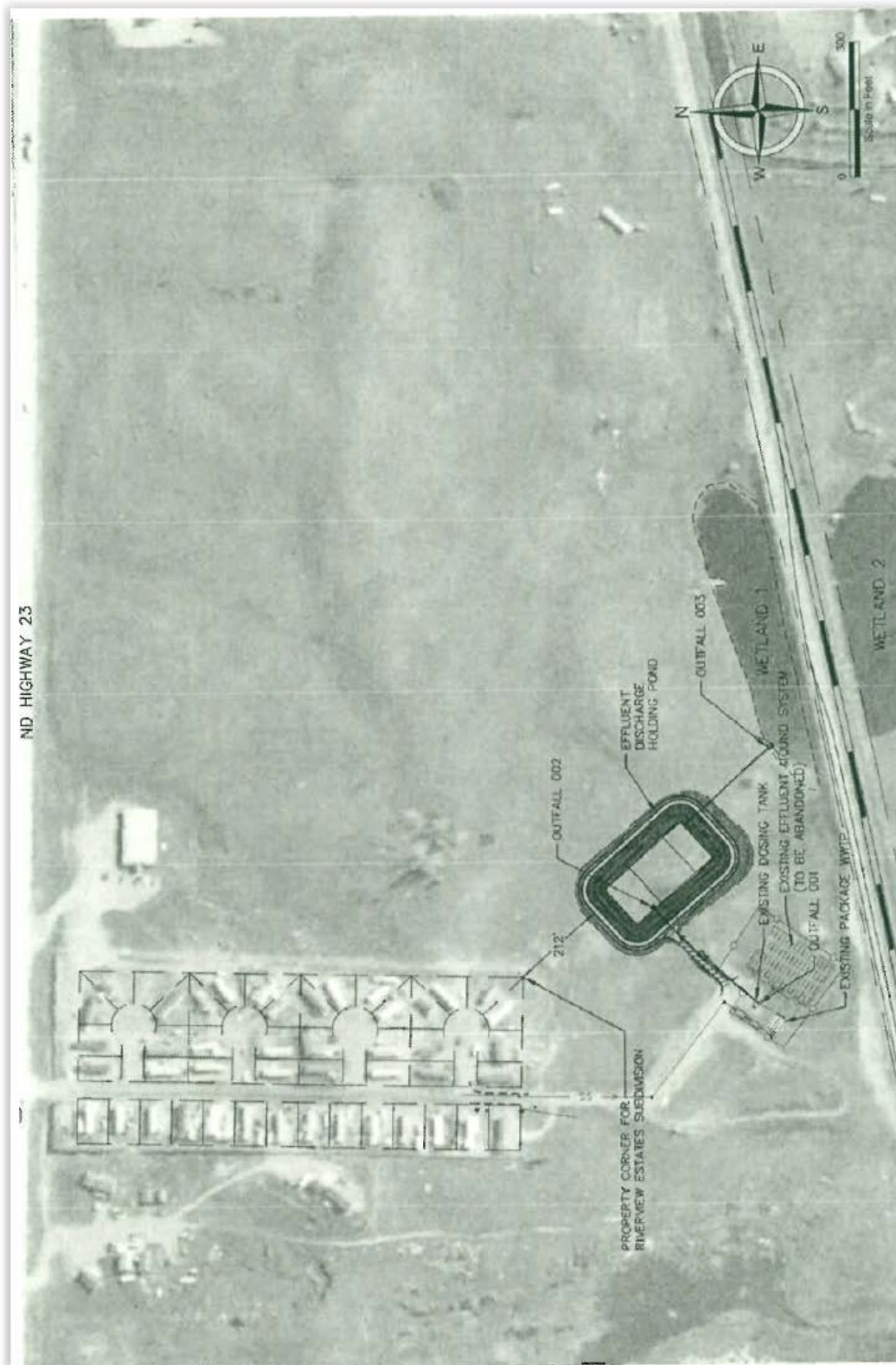
Exhibit 1. Site Layout

The following exhibits provide the site layout and schematic of the treatment facility and wastewater collection system: