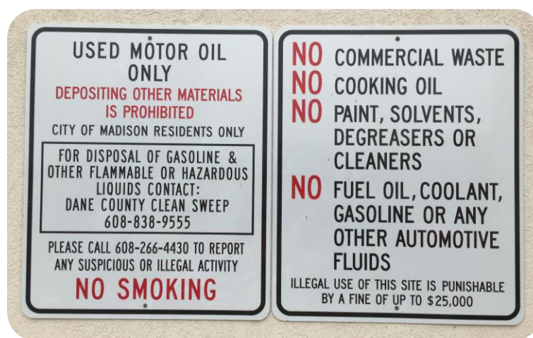
New signs posted at a city of Madison used oil collection site.

The city expects to further invest in dual-compartment tanks when they upgrade all of their public used oil drop-off sites. Once upgrades are made, city residents will be able to continue to drop off used oil when a full compartment is locked out after sampling.