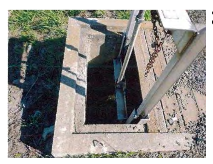
Outfall to Long Hollow Creek