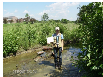
Above: An urban forestry intern

The Society of Municipal Arborists (SMA) has a special program to match communities with urban forestry interns -- and SMA and the U.S. Forest Service pick up the bill. Municipalities host students for 10 weeks during the summer or they may apply for an intern to help with a specific project where the hours are determined by the project needs. Students receive $15/hour, a housing stipend of $1,200, and registration and $300 travel scholarship to attend the Fall 2017 Annual SMA Conference in Tulsa, OK.