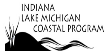
Above: Lake Michigan Coastal Program logo.

The Indiana Department of Natural Resources Lake Michigan Coastal Program seeks nominations for all Voting Board Members to the Coastal Advisory Board. Appointments are for two years beginning with the April 19, 2017 meeting and running through February 2019. Nominees must work or reside in the Coastal Program area. Click here to review information about Board member duties and responsibilities before submitting a nomination. Nominations are due March 3.