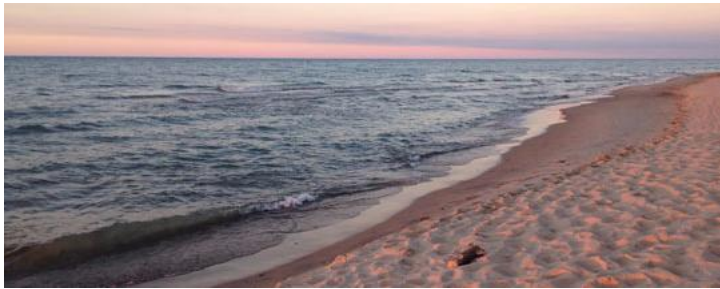
Above: Photo of Lake Michigan shoreline from Lake Michigan Coastal program website.

The LMCP is seeking a Program Manager to lead the team. The LMCP provides technical and financial assistance to state, regional, and local partners to protect, preserve and utilize coastal resources. The program also helps coordinate state