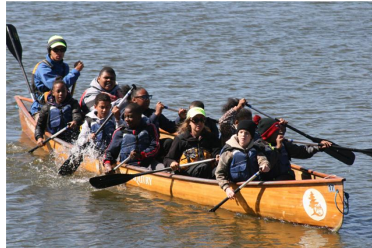
Above: Photo of students canoeing

Wilderness Inquiry's Canoemobile returns to Northwest Indiana in September and October! Many partners, including Dunes Learning Center, LaPorte County Soil & Water District, and National Park Service will connect hundreds of local youth to our urban waterways with this incredible experience.