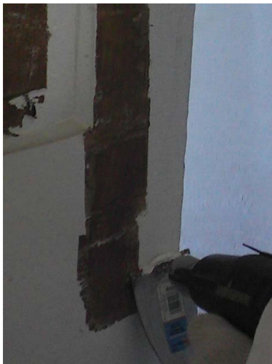
Figure A-6. Using chisel to remove heated paint from door

Approximately 53 ft 2 of paint was removed from the baseboards, window trim, fireplace, and door trim of a second floor bedroom using two heat guns operating at temperatures above 1100°F.