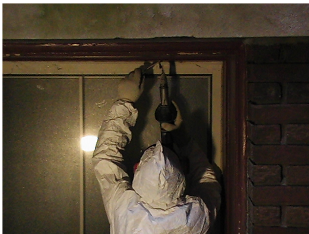
Figure A-12. Removing paint from door trim using heat gun

The workers removed paint from all flat surfaces on an exterior door and door casing using heat guns operated at about 1000 degrees Fahrenheit. The door, which opens into the ground level of a closed school, was located at the bottom of a set of stairs. Small areas of paint remained door panels and curved sections of door casing. It took approximately 1 hour and 20 minutes to set up the containment area and 4 hours to complete the paint removal.