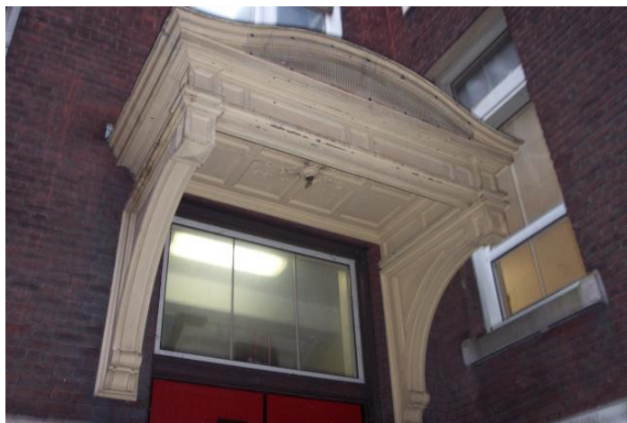
Figure A-10. Awning prior to work

Two workers removed paint from an exterior awning above a doorway outside a school using heat guns above 1100 degrees Fahrenheit. The awning is located in the same courtyard as the other two exterior jobs at the school that is surrounded on three sides by 3-story brick walls. The awning extends about 4 feet from the wall above the doorway. Paint was removed from trim, the ceiling, and the ornate painted supports. Work was halted after approximately five hours of paint removal work even though only about 30 ft 2 of surface area was worked on.