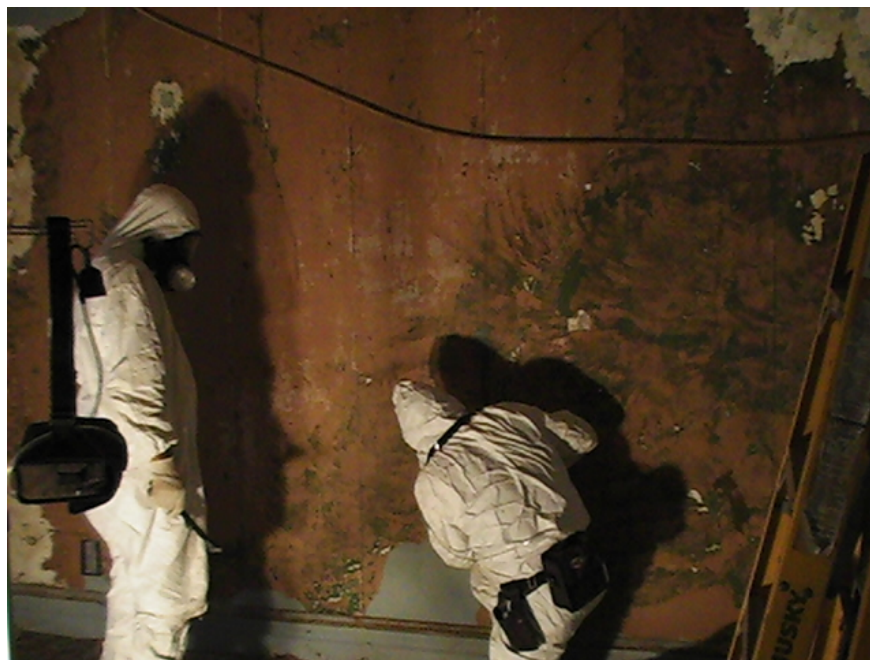
Figure A-4. Dry scraping paint from wall

Paint was removed from one wall of a second floor room. Using dry scraping tools, deteriorated paint was removed in preparation for repainting, but not all paint was removed down to the plaster, if intact.