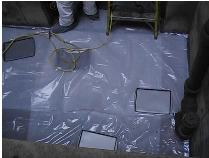
Figure A-13. Dust collection trays outside door paint removal job

* Results of bulk debris samples added to dust wipe sample