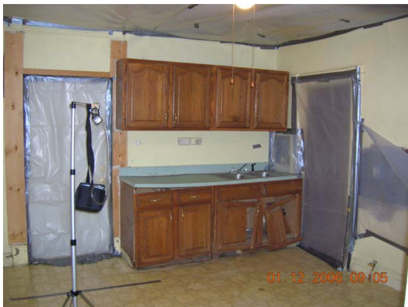
Figure A-5. Kitchen cabinets prior to removal

The job included the removal of a counter top, sink and cabinets from a first floor kitchen.