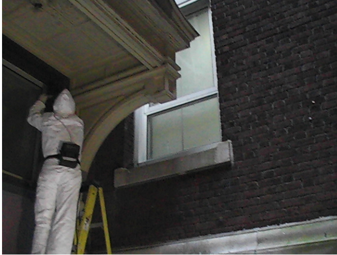
Figure A-11. Removing paint from awning using heat gun