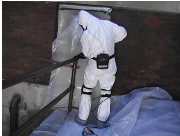
Figure A-8. Removing paint from railing

The workers removed deteriorated paint from a metal railing outside a school using a needle gun tool. The railing, located in a courtyard surrounded on three sides by 3-story brick walls, extended about 20 feet from the wall opposite the opening. The railing is set in concrete raised about 1 foot off the ground. One side of the raised concrete was a drop to a set of stairs and a patio about six feet below the base of the railing. The paint removal work took approximately 4 hours to complete.