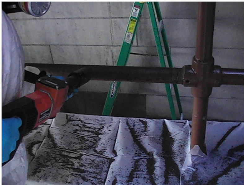
Figure A-9. Close-up of railing paint removal