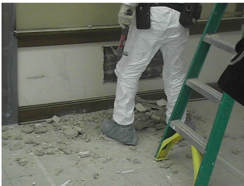
Figure A-1. Wall cut out at school