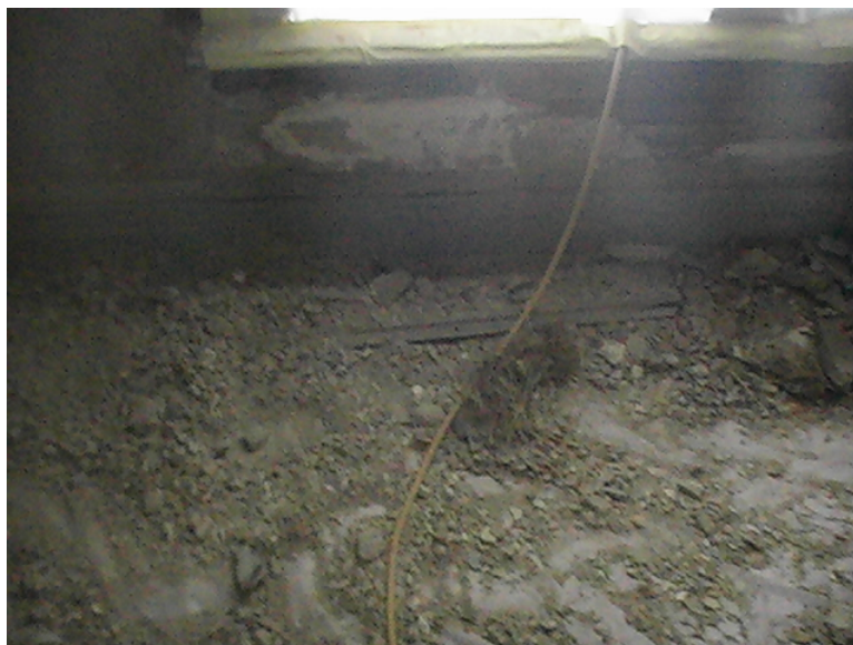
Figure A-3. Work room floor following removal of paint

of the length of time required to perform the work, the post-cleaning wait time was skipped. An off-duty Columbus police officer was present.