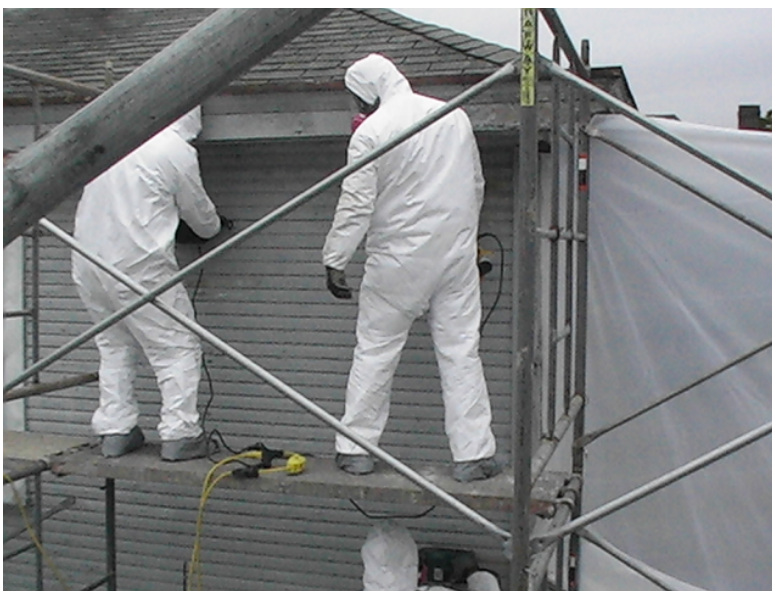
Figure A-7. Power grinding paint from 2 nd story wall

The workers removed deteriorated paint from 100 ft 2 on a 2-story section of wall at a single family home using power grinders that used metal disks rather than sandpaper. The north wall that they removed paint from was about 20 feet high. The scraping generated a large amount of paint chips and dust throughout the entire containment zone. It took approximately 2 hours to complete the paint removal.