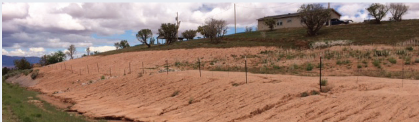
BEFORE (October 2016): Eroded soil at the base of the site.

U.S. Environmental Protection Agency (USEPA) excavated parts of the site contaminated by mining activity from September to November 2012. About 12,370 cubic yards of soil and native vegetation were removed. After the removal, intense rain storms caused sections of the site to slope and nearby areas became highly-eroded. This erosion formed small channels and gullies throughout much of the site. In September 2017, USEPA completed work at the site (see page 2 for more information) to prevent surface erosion at the former transfer area.