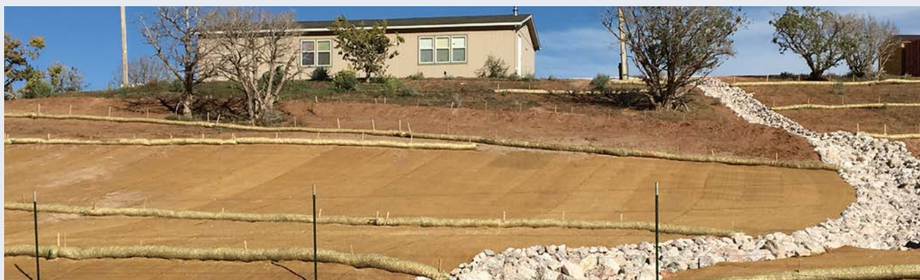
AFTER (November 2017): Stabilized slope and restored drainage channel made of rock material.