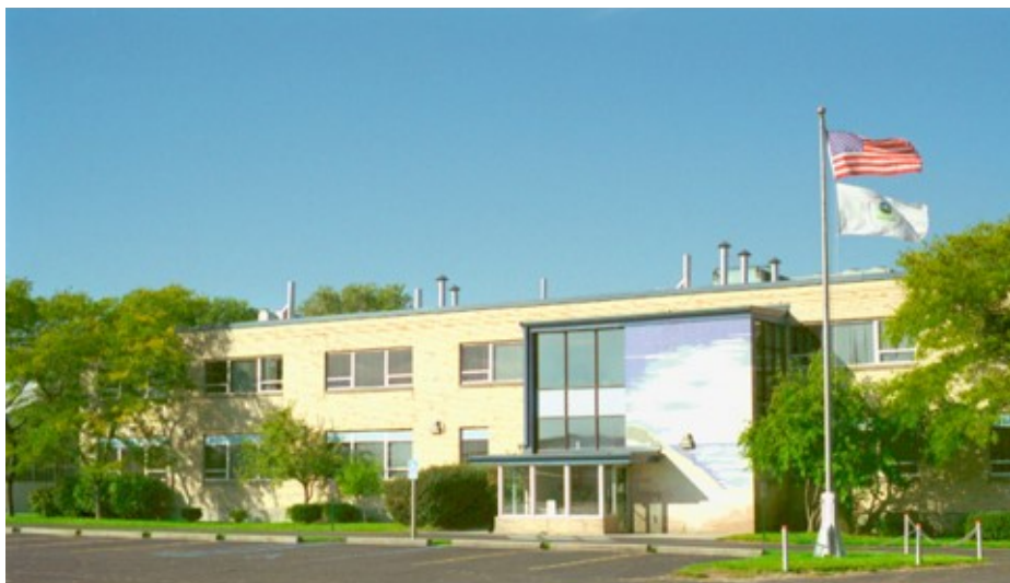
Figure 1: View of Large Lakes Research Station, Grosse Ile, Michigan

To achieve greater agencywide water efficiency and to meet EISA requirements, a desk-based water assessment was conducted for the LLRS on March 16, 2016.