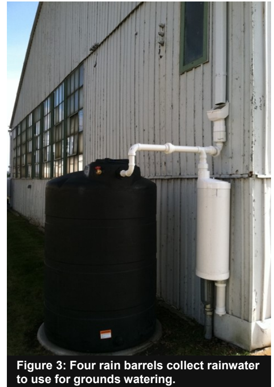
Figure 3: Four rain barrels collect rainwater to use for grounds watering.

In support of its stormwater management program, the LLRS installed four rain barrel collection devices to collect rainfall from building roofs. Three 500-gallon rain barrels and one 300-gallon rain barrel were installed. Water collected in the rain barrels is used for grounds watering. According to the LLRS, approximately 26,000 gallons of water are collected and used annually for vegetation watering.