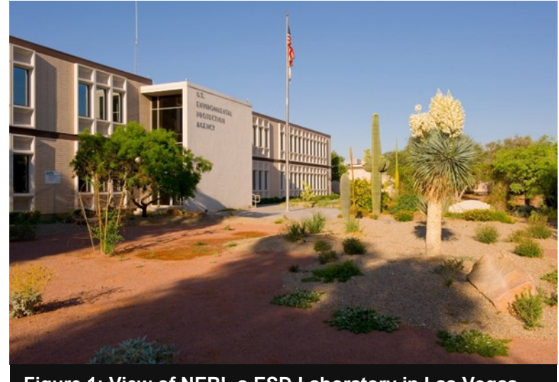
Figure 1: View of NERL s ESD Laboratory in Las Vegas, Nevada.

The Energy Independence and Security Act (EISA) of 2007 directs agencies to complete comprehensive energy and water evaluations for 25 percent of covered facilities (i.e., those accounting for 75 percent of total agency energy use) each year, resulting in each covered facility being assessed once every four years. It also directs agencies to implement cost-effective measures identified through life cycle analyses and to measure and verify water savings.