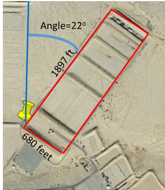
Figure 4-1: Example of Fugitive release point parameters