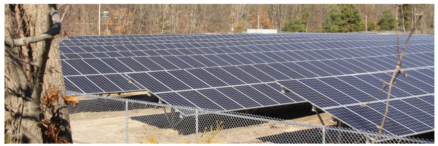
Solar panels on the Shaffer Landfill at the Iron Horse Park Superfund site.