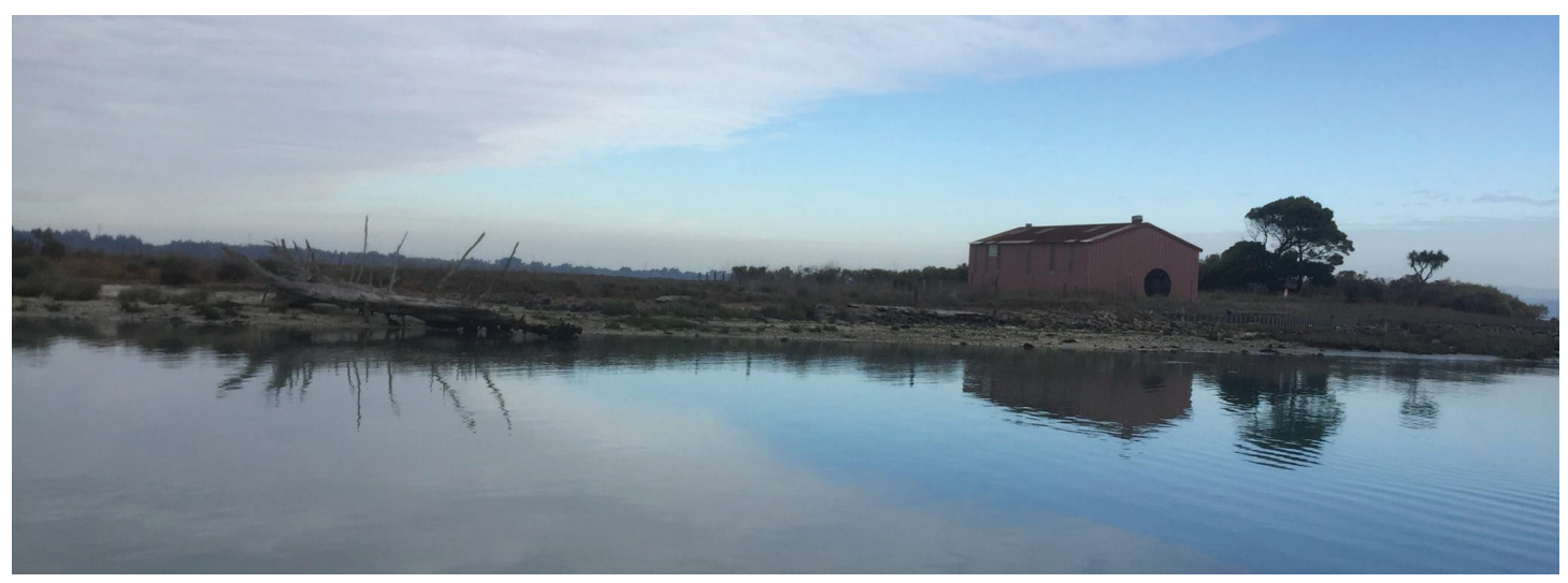
View of the restored Tuluwat Village site on Indian Island in Eureka, California.