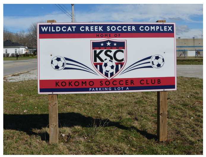
The Wildcat Creek Soccer Complex, located on part of the Continental Steel Superfund site, offers recreational amenities to the community.