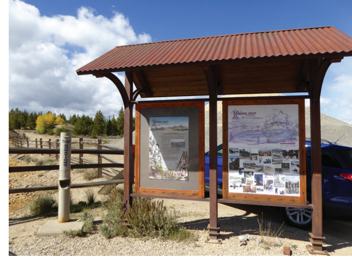
The Mineral Belt Trail, an award-winning, multi-use recreation trail at the California Gulch Superfund site in Leadville, Colorado, is one of several uses that earned an Excellence in Site Reuse Award.

7. Design of reuse complementary with sustainability of the selected remedy.