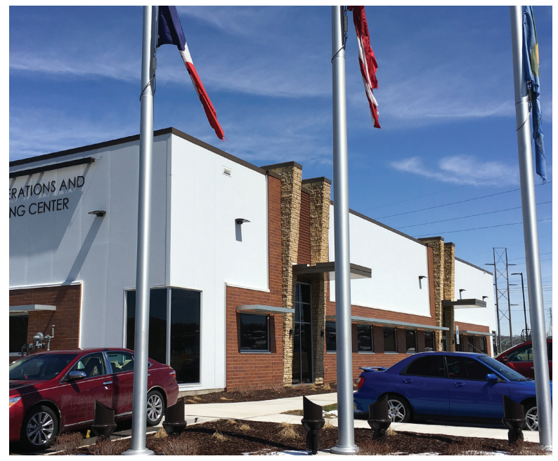
Region 7 recognized the new Jule Public Transit Operations and Training Center at the Peoples Natural Gas Co. Superfund site with a L.E.A.F.S. award.

At the John Deere (Dubuque Works) Superfund site, the company installed 6 inches of soil across the northern part of the landfill surface, seeded native grasses and wildflowers to stabilize soil, installed a walking trail to promote employees' wellbeing, and installed pollinator habitats that will increase species diversity.