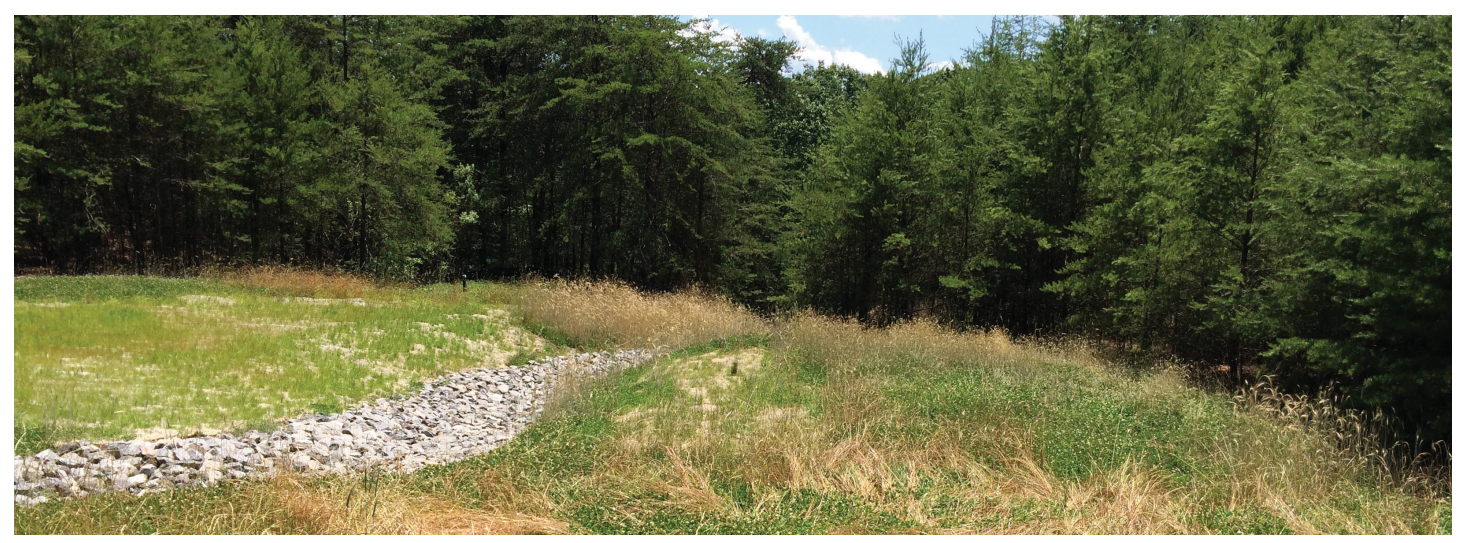
Native plant revegetation at the Excellence in Site Reuse Award-winning Henry's Knob Superfund Alternative Approach site.