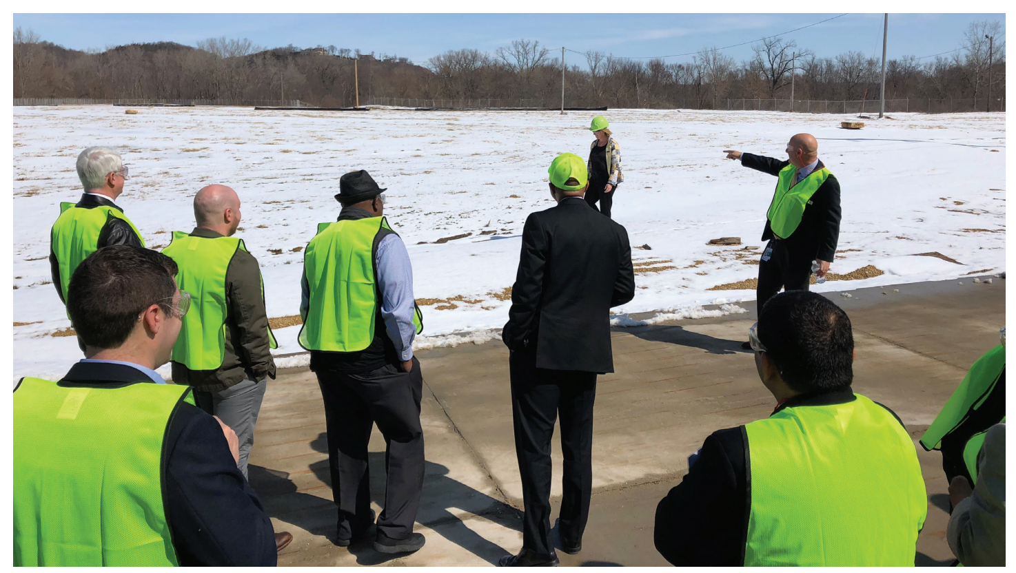
Touring part of the John Deere (Dubuque Works) Superfund site where native plantings and walking trails are supporting local ecology and providing recreation amenities for company employees.