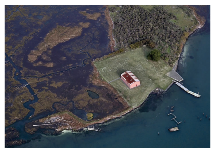
Region 9 recognized the Tuluwat Village site with an Excellence in Site Reuse Award.