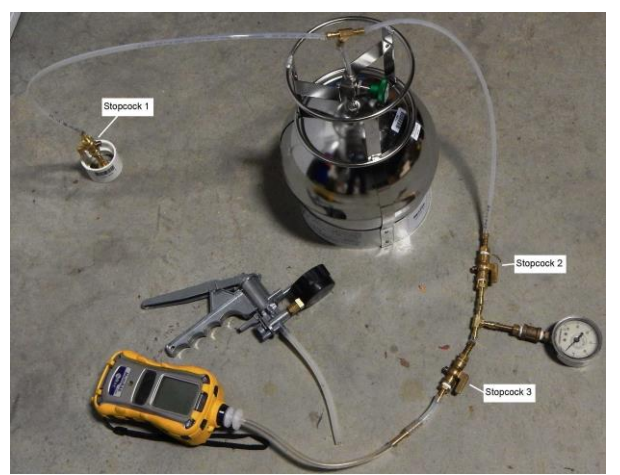
Figure 1. Example of Sub-Slab Sampling and Leak-Test Setup

Vapor Pin® protected under US Patent # 8,220,347 B2