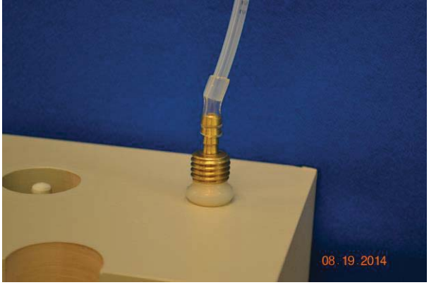
Figure 5. Vapor Pin<sup>™</sup> sample connection.

tubing (Figure 5). Put the Nylaflow tubing as close to the Vapor Pin as possible to minimize contact between soil gas and Tygon<sup>TM</sup> tubing.