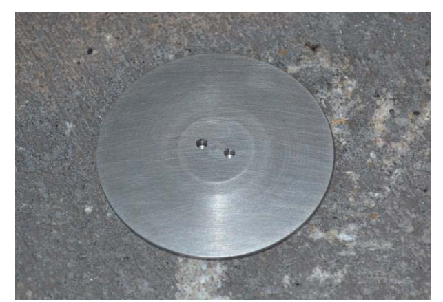
Figure 4. Secure Cover Installed

7) For flush mount installations, cover the Vapor Pin<sup>™</sup> with a flush mount cover, using either the plastic cover or the optional stainless-steel Secure Cover (Figure 4).