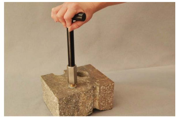
Figure 7. Removing the Vapor Pin^{TM} .

Prior to reuse, remove the silicone sleeve and protective cap and discard. Decontaminate the Vapor Pin<sup>™</sup> in a hot water and Alconox<sup>®</sup> wash, then heat in an oven to a temperature of 265° F (130° C) for 15 to 30 minutes.