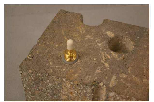
Figure 3. Installed Vapor Pin<sup>™</sup>

During installation, the silicone sleeve will form a slight bulge between the slab and the Vapor Pin^{TM} shoulder. Place the protective cap on Vapor Pin^{TM} to prevent vapor loss prior to sampling (Figure 3).