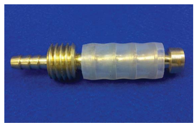
Figure 1. Assembled Vapor Pin<sup>™</sup>

VOC-free hole patching material (hydraulic cement) and putty knife or trowel for repairing the hole following the extraction of the Vapor Pin<sup>™</sup>.