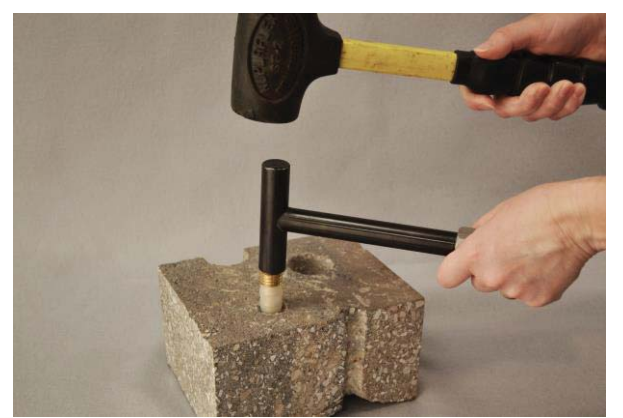
Figure 2. Installing the Vapor Pin<sup>™</sup>.

During installation, the silicone sleeve will form a slight bulge between the slab and the Vapor Pin^{TM} shoulder. Place the protective cap on Vapor Pin^{TM} to prevent vapor loss prior to sampling (Figure 3).