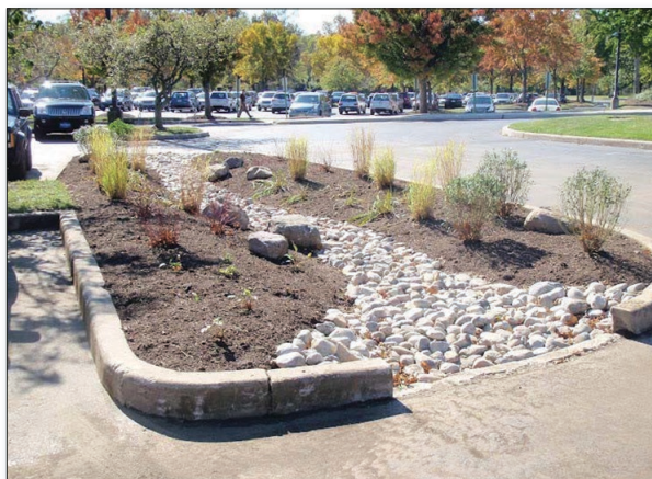
Figure 2. Completed rain garden at Subaru of America in Cherry Hill, New Jersey.

partners such as Rutgers Cooperative Extension Water Resources Program, Rutgers Cooperative Extension of Camden County, and extensive volunteer effort, began implementing the plan in 2007. To date, approximately 42 rain gardens, 14 stormwater basin retrofits, a stream bank restoration, a floating island pond treatment unit, a biofilter wetland and a buffer restoration have been implemented (Figure 2). Partners constructed most of these projects on public lands: schools, parks, community centers or within the median of municipal roadways. However, several demonstration rain gardens were constructed on commercial properties. In addition, partners implemented extensive education efforts to raise awareness about