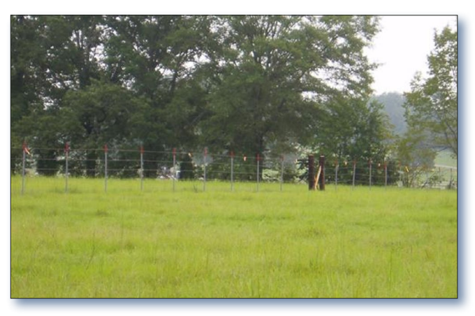
Figure 3. Fencing was used to provide a barrier to control livestock and manage sensitive riparian areas.

In 2011 MDEQ returned to Limekiln Creek to collect biological community data. The score was 45.54, above the assessment threshold of 38.5 required to indicate water quality is sufficiently good to support healthy populations of aquatic life in this region of Mississippi. Using this 2011 data, Limekiln Creek was assessed as attaining the aquatic life use in the 2014 CWA section 305(b) report and was removed from the state's impaired waters list.