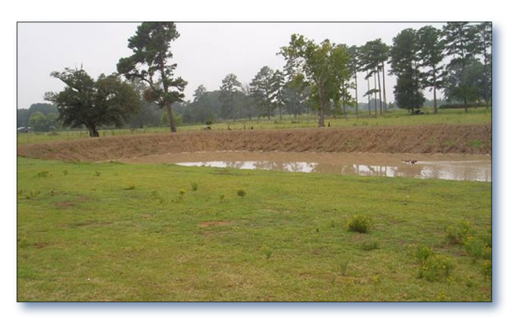
Figure 2. Water and sediment control basins were used to trap sediment and runoff from agricultural areas.

In addition, NRCS implemented 12 BMPs in the Limekiln Creek watershed between 2009 and 2015 and plans to install 15 more practices. Some of the implemented BMPs include critical area stabilization, heavy use area protection, livestock pipeline, seasonal high tunnel systems for crops, and watering facilities.