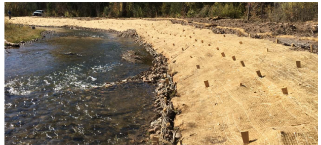
The White Mountain Apache Tribe streambank was seeded with a native grass seed mixture, then covered in an all-natural double net erosion control fabric. The fabric acts as a mulch and provides short term bank protection. Plugs of wet-land plants (sedges) were planted to help establish vegetation.