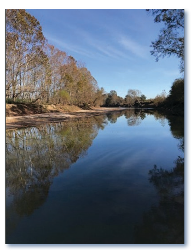
Figure 3. Bayou Sara now fully supports its PCR designated use.

Water quality data showed improvement as a result of inspections and repairs. Fecal coliform data from the 2016–2017 sampling year showed that only one out of six events exceeded the criterion (a 16.7 percent exceedance rate) at AWQMN site 1108 from May 1 to October 31, which is below the 25 percent exceedance rate limit noted in the water quality standard (Figure 2). On the basis of these data, in the 2018 CWA section 305(b) report LDEQ indicated that Bayou Sara is fully supporting its PCR designated use and is no longer listed as impaired for bacteria (Figure 3).