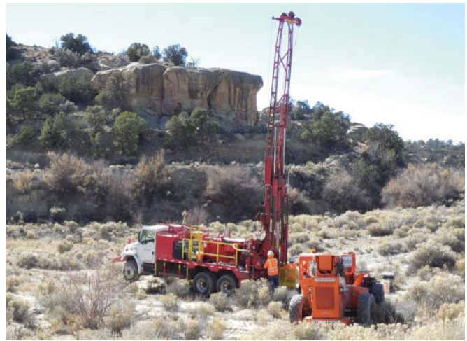
GE contractors take samples on the Northeast Church Rock Mine site.

NRC must approve the request for a license amendment at the UNC Mill Site before the NECR Mine Site cleanup construction can begin. The NRC estimates two to five years for the required NRC license amendment. Cleanup construction is anticipated to take approximately four years to complete.