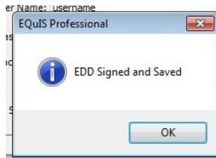
Figure 15: saved the EDD file

5. Select Save. Once the zipped EDD Package has been saved the following screen will appear.