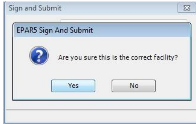
Figure 14: verify the facility

4. Click “Yes”. Users will be prompted to provide a filename and location where you would like to save the file. The Sign and Submit feature will save an archived (“zipped”) the current date, a period, the EPA ID, a period and the Format File name used to create the EDDs . (Example file name: ‘20160811.MID000000001.EPAR5.zip’). The contents of the Zipped file include text files named for the sections of the format used to create them.