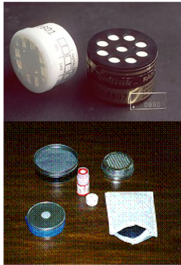
Radon Test Kits