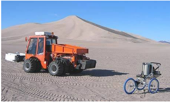
Ground and Gamma Scanners