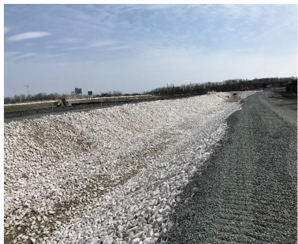
Tin Mill Canal: After