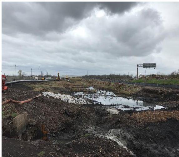
Tin Mill Canal: Before

Maintenance cleanup of the Tin Mill Canal is currently ongoing at the Facility. The cleanup effort generally includes removal and dewatering of sediment, cleaning of outfalls, disposal of non-hazardous sediments at Grey's Landfill, and placement of a cap. Since the April 2018 public meeting, capping of Sections #3 and #4 of the Canal have been completed.