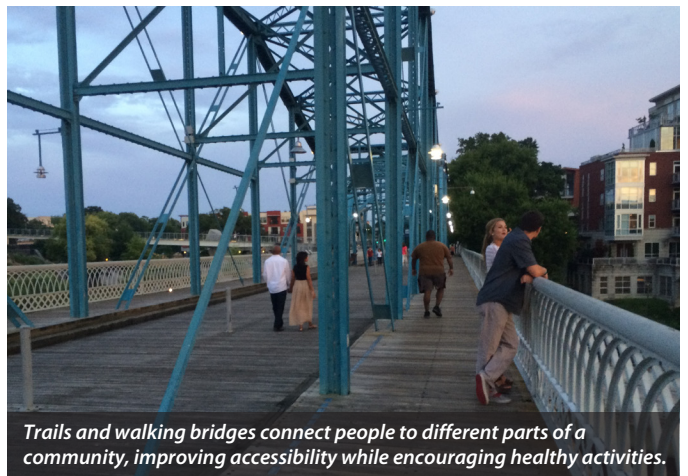
Trails and walking bridges connect people to different parts of a community, improving accessibility while encouraging healthy activities.

For more information: https://www.epa.gov/smartgrowth/local-foods-local-places