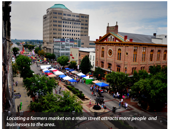
Locating a farmers market on a main street attracts more people and businesses to the area.

St. Mary's Nutrition Center in Lewiston-Auburn wants to integrate local foods into downtown revitalization and economic development strategies, ensure land use planning can support local agriculture, and connect existing food and agriculture efforts to strengthen food access and create market opportunities for local farmers.