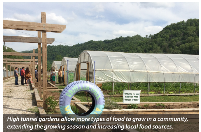
High tunnel gardens allow more types of food to grow in a community, extending the growing season and increasing local food sources.