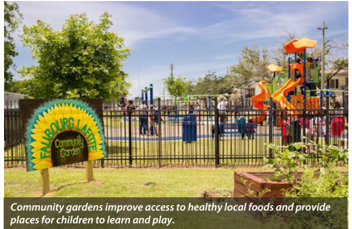
Community gardens improve access to healthy local foods and provide places for children to learn and play.

The town of Pulaski wants to explore how various food access and healthy living programs can contribute to ongoing downtown revitalization, including adaptive reuse of former industrial and manufacturing spaces.