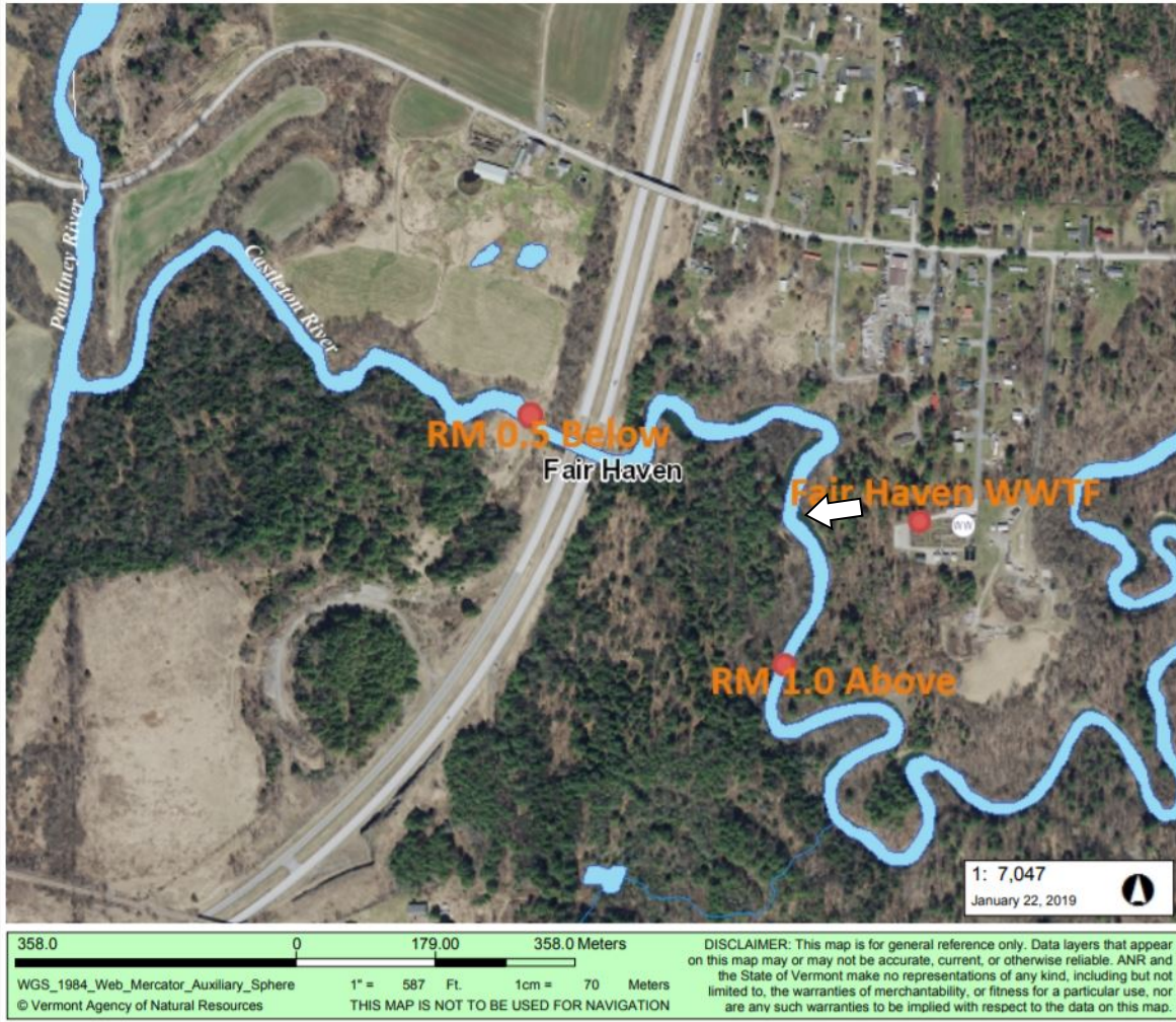
Figure 1. Castleton River near the Fair Haven WWTF, showing upstream (RM 1.0) and downstream (RM 0.5). Outfall location shown by arrow.

Total Phosphorus (TP) below the outfall (RM 0.5) ranged from 15.5 – 16.8 µg/L while above the outfall (RM 1.0) TP ranged from 12.2 – 14.4 µg/L. TP increase measured from above to below ranged from 2.3 – 3.3 µg/L, average increase of 2.9 µg/L for the (3) sampling events in 2015 (Table 1).