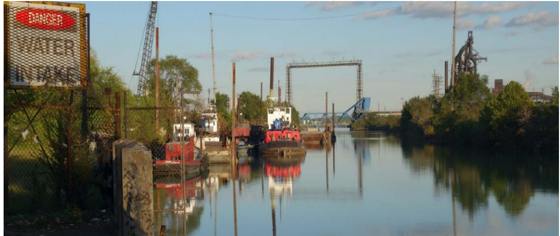
Figure 1. Lower Rouge River – Old Channel.

Susan Virgilio 312-886-4244 Virgilio.susan@epa.gov